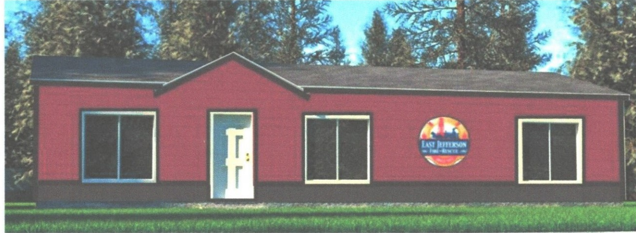
Firehouse rendering after it is painted in EJFR colors

As most of you know, the Marrowstone Island Foundation (MIF) has been engaged in a multi-year effort to secure a building on Marrowstone Island to house volunteer firefighters and EMTs. These efforts are about to bear fruit with the delivery of a firehouse this August.