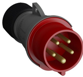
3P+N+PE 16 A

4 wire 3 phase 240 V 30 Amp service – use NEMA 15-30P plug