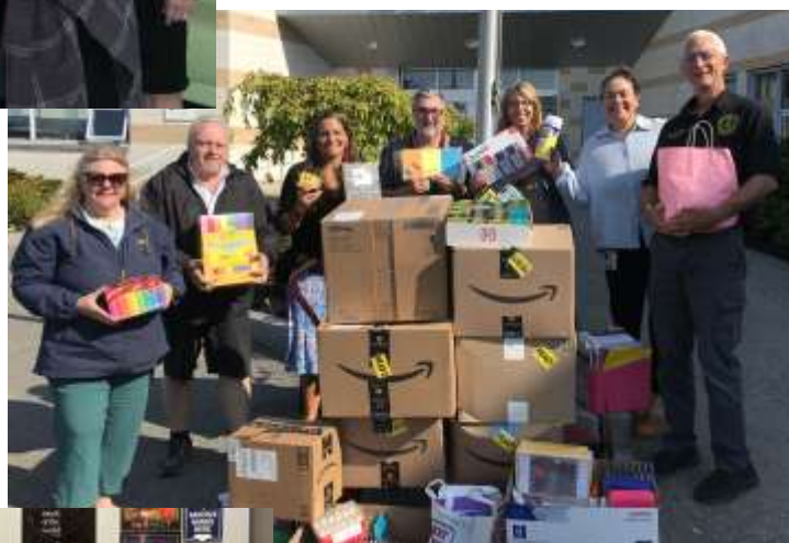
BOTTOM: Skillin School