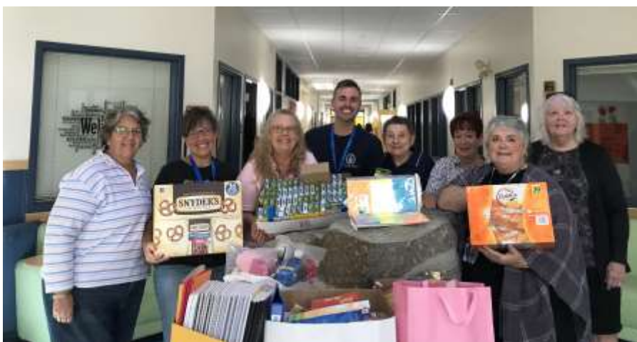
TOP: Congin School

2024 was the third year the Activity Committee received the ENF Beacon Grant. Each year, three local elementary schools are selected to receive school supplies for the teachers and their classrooms. In addition to the items purchased with the grant, members generously donated more than $1,200 worth of additional supplies. The supplies were delivered September 9-11 to Congin School in Westbrook, East End Community School in Portland, and Skillin School in South Portland. For the teachers, it's like Christmas came early!!