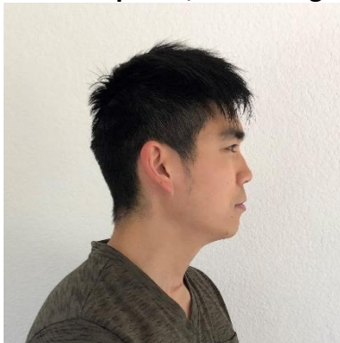
#3 Side photo, no smiling