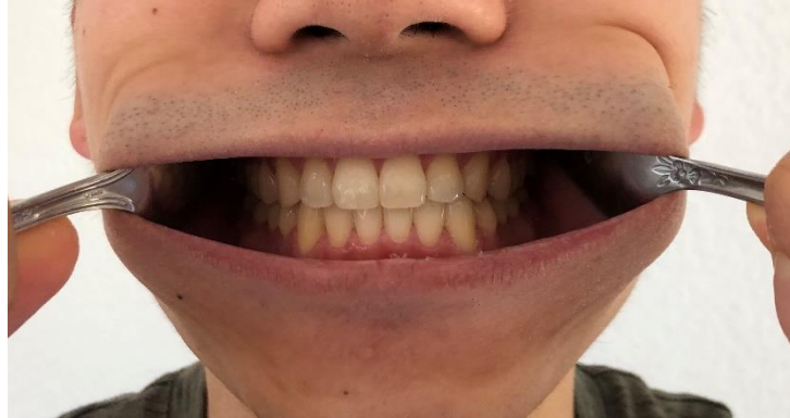
#5 Front teeth

Then have them remove one of the spoons to get a side shot of the teeth. Repeat on the other side.