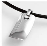
"Concave" Handcrafted Sterling Silver Pendants ©