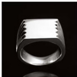
'Saw' Handcrafted Sterling Silver Ring ©