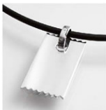
"Saw" Handcrafted Sterling Silver Pendants ©