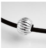
"Vikki" Handcrafted Sterling Silver Pendants ©