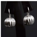
"Vikki" Handcrafted Sterling Silver Earrings ©