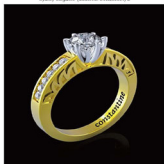
Sydney Deluxe (Model no. CVEL00003) ©