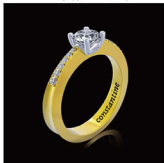
Adelaide 'Dintae' (Model no. CXL00052) ©