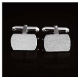
Float Handcrafted Sterling Silver Cufflinks ©