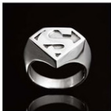
'Super' Handcrafted Sterling Silver Ring ©