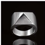
'Egypt' Handcrafted Sterling Silver Ring ©