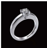
Melbourne 'Simplicity' (Model no. CVL000101)