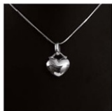
"Love" Handcrafted Sterling Silver Pendants ©