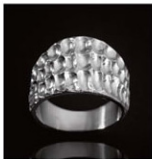
'Gator' Handcrafted Sterling Silver Ring ©