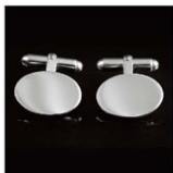
Smooth Handcrafted Sterling Silver Cufflinks ©