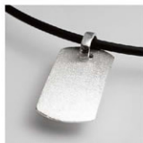
"Frost" Handcrafted Sterling Silver Pendants ©