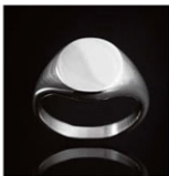
'Signet Large' Handcrafted Sterling Silver Ring ©