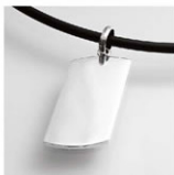
"Angler" Handcrafted Sterling Silver Pendants ©