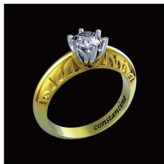
Sydney Elegance (Model no. CVEL00001) ©

This hand crafted 18 carat yellow and white gold ladies diamond-set engagement ring has been inspired by the Sydney Opera House, constructed in 1961 through to 1973. It is one of the most recognisable symbols of Australia. The Sydney Opera House provides a world renowned icon for one of the most beautiful harbours in the world and holds a special place in the city's heart. The perfect choice for an engagement in Sydney never to be forgotten.