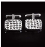
Gator Handcrafted Sterling Silver Cufflinks ©