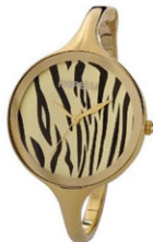
Fiorelli 'Altira' ladies watch