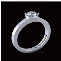
Hobart Simplicity (Model no. CVEL0000056) ©