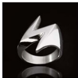
'Pault' Handcrafted Sterling Silver Ring ©