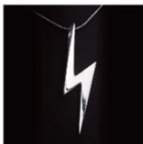
"Flash" Handcrafted Sterling Silver Pendants ©