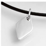
"Elegance" Handcrafted Sterling Silver Pendants ©