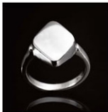
'Elegance' Handcrafted Sterling Silver Ring ©