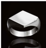
'Diamond' Handcrafted Sterling Silver Ring ©