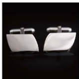
Angler Handcrafted Sterling Silver Cufflinks ©