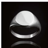
'Signet Small' Handcrafted Sterling Silver Ring ©