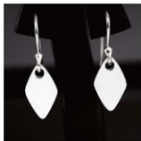
"Elegance" Handcrafted Sterling Silver Earrings ©