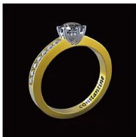
Hobart Deluxe (Model no. CVEL0000110) ©

Inspired by Tasmania's famous 'apple-shaped isle', Hobart is the capital city of Tasmania, founded in 1875 by Lord Hobart. Hobart is home to some of the most spectacular scenery in Australia. Hobart is a blend of heritage, lifestyle, scenery and vibrant culture. An engagement for the couple who thrive on excitement and inspiration.