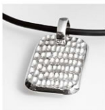
"Gator" Handcrafted Sterling Silver Pendants ©