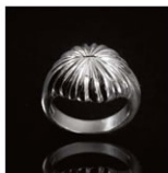
'Vikki' Handcrafted Sterling Silver Ring ©