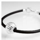
"Vikki" Handcrafted Sterling Silver Bracelet ©