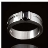
'Sapphires' Handcrafted Sterling Silver Ring ©