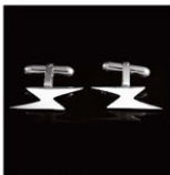
Flash Handcrafted Sterling Silver Cufflinks ©