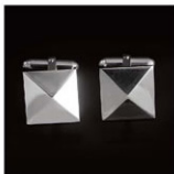
Egypt Handcrafted Sterling Silver Cufflinks ©