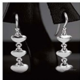
"Love" Handcrafted Sterling Silver Earrings ©