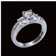
Perth Deluxe (Model no. CVEL000075) ©