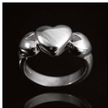
'Love' Handcrafted Sterling Silver Ring ©