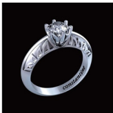
Sydney Elegance (Model no. CVEL00002) ©