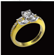
Perth Deluxe (Model no. CVEL000077) ©