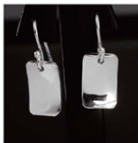
"Concave" Handcrafted Sterling Silver Earrings ©