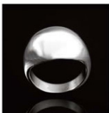
'Dome' Handcrafted Sterling Silver Ring ©