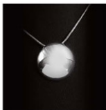
"Dome" Handcrafted Sterling Silver Pendants ©