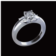
Perth Elegance (Model no. CVEL000071)