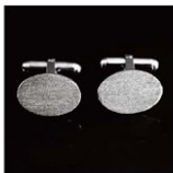
10K Handcrafted Sterling Silver Cufflinks ©