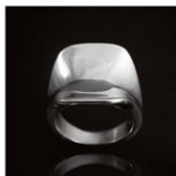
'Concave' Handcrafted Sterling Silver Ring ©