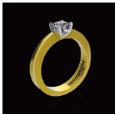
Adelaide 'Simplicity' (Model no. CXL00055) ©

This hand crafted 18 carat yellow and white gold ladies diamond-set engagement ring design has been inspired by Adelaide 'the city of churches'. Adelaide was founded in 1836 by Colonel William Light. Adelaide today is known for its wide sweeping streets, city squares and lush green boundaries which make the city an exciting one to explore. An engagement for the couple who desire eternal enchantment.