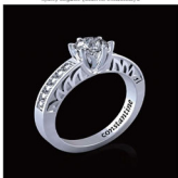
Sydney Deluxe (Model no. CVEL00004) ©