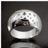
'Holy Dome' Handcrafted Sterling Silver Ring ©

Original designs for Corporate clientele and lovers of classic silver jewellery. Ideal for corporate rewards and points redemption. Although suitable for a lower budget these pieces are of the best quality with exceptionally high grade finish. Stunning additions made for your silver collection.