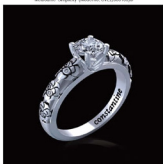
Melbourne 'Deluxe' (Model no. CVL000102)