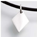
"Diamond" Handcrafted Sterling Silver Pendants ©