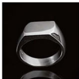
'Angler' Handcrafted Sterling Silver Ring ©