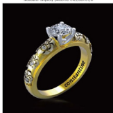
Melbourne 'Deluxe' (Model no. CVL000103)