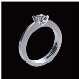
Adelaide 'Simplicity' (Model no. CXL00055-1)