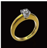
Melbourne 'Simplicity' (Model no. CVL000100)

This hand crafted 18 carat yellow and white gold engagement ring design, has been inspired by Melbourne the capital city of Victoria, founded in 1836 by Governor Bourke. Melbourne draws its influence from the fascinating botanical wonderland of the Royal Botanic Gardens, established in 1846. These gardens are some of the most spectacular in the world, making it the ideal momento of an engagement in Melbourne all year round.