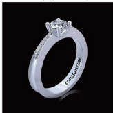
Adelaide 'Dintae' (Model no. CXL00052) ©