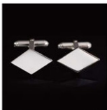
Diamond Handcrafted Sterling Silver Cufflinks ©