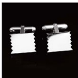
Saw Handcrafted Sterling Silver Cufflinks ©