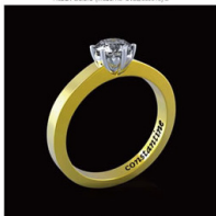
Hobart Simplicity (Model no. CVEL0000055) ©