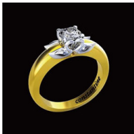
Perth Elegance (Model no. CVEL000071) ©

This hand crafted 18 carat yellow and white gold ladies diamond-set engagement ring design, has been inspired by Perth's unique and majestic Australian black swan. Perth was founded in 1829 by Captain James Stirling and was known as the 'black swan' colony. The Black Swans are still in existence today and can be seen along the superb Swan River. Perth today is known for excellent weather, pristine parklands, beaches and easy-going character. An engagement for lovers of nature.