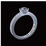
Hobart Deluxe (Model no. CVEL0000111) ©