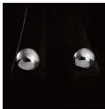
"Dome" Handcrafted Sterling Silver Earrings ©