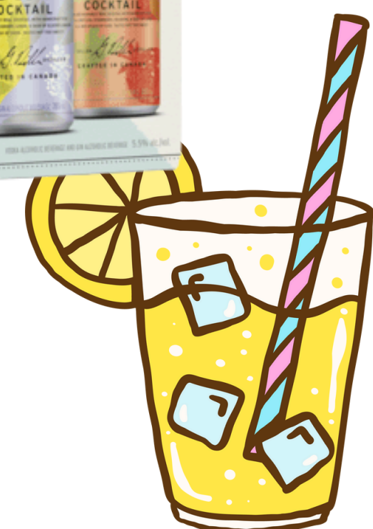
DILLON'S VARIETY PK 24 CANS