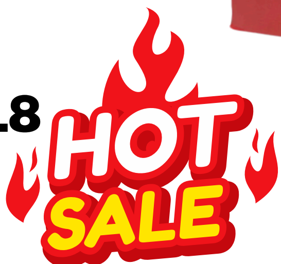
SEA CHANGE 18PK MIXER