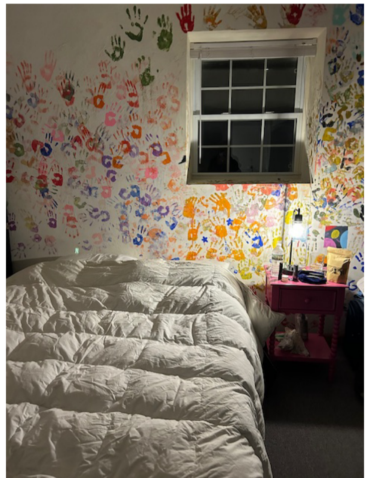
photo popped up as I was searching for the wall from the village. I am not needing to say anymore about these coincidences. It is pleasantly peculiar as I reminisce as to why I decided to become a