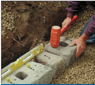
2. Install the Base Course

Remove all surface vegetation and debris. Do not use this material as backfill. After selecting the location and length of the wall, excavate the base trench to the designed width and depth (min. 20" w x 12" d). Start the leveling pad at the lowest elevation along wall alignment. Step up in 6" increments with the base as required at elevation changes in the foundation. Level the prepared base with 6" of well-compacted granular fill (gravel, road base, or 1/2" to 3/4" crushed stone). Compact to 95% Standard Proctor or greater. Do not use PEA GRAVEL or SAND for leveling pad.