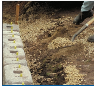
4. Install Fill & Compaction

Place the shouldered fiberglass pins into the holes of the Units (note: place one pin only per each grouping of three holes). Place pins in the middle hole for near vertical alignment or the holes nearest the embankment for a 9.5° +/- batter per course. According to wall requirements and design, the front pin hole (towards the face of the wall) can be used randomly to allow a forward projection of a specific unit for accent and variation in the wall appearance.