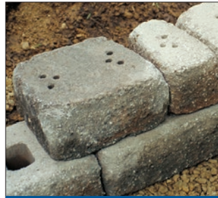
5. Install Additional Courses

Once the pins have been installed, provide 1/2"-3/4" crushed stone drainage fill behind the units to a minimum depth of 12". Fill open spaces between units and open cavities/cores with the same drainage material. Proceed to place backfill in maximum 6" layers (lifts) and compact to 95% Standard Proctor with the appropriate compaction equipment. Do not use heavy ride-on compaction equipment within 3' from back of wall. Do not use jumping or ramming type compaction.