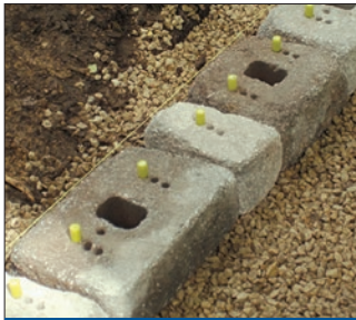
3. Insert Fiberglass Pins

Place the first course of units end to end (with front corners touching) on the prepared base. The long groove (receiving channel) on the unit should be placed down and the three pin holes should face up, as shown. Make sure each unit is level - side to side and front to back. Leveling the first course is critical for accurate and acceptable results. For alignment of straight walls, use a string line aligned on the unit pin holes for accuracy. Minimum embedment of base course is 6" below grade.