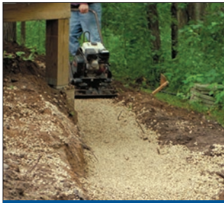
1. Prepare Base Leveling Pad

Remove all surface vegetation and debris. Do not use this material as backfill. After selecting the location and length of the wall, excavate the base trench to the designed width and depth (min. 20" w x 12" d). Start the leveling pad at the lowest elevation along wall alignment. Step up in 6" increments with the base as required at elevation changes in the foundation. Level the prepared base with 6" of well-compacted granular fill (gravel, road base, or 1/2" to 3/4" crushed stone). Compact to 95% Standard Proctor or greater. Do not use PEA GRAVEL or SAND for leveling pad.