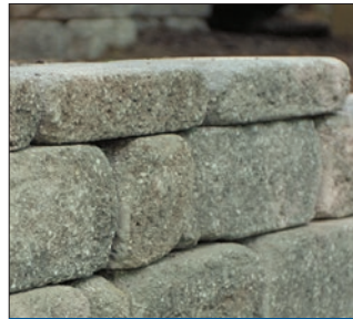
6. Capping the Wall

Place the next course of units over the fiberglass pins, fitting the pins into the long receiving channel recess of the units above (Note: Some removal of debris in the pin holes and channel may be necessary prior to placement). Push the units toward the face of the wall until they make full contact with the pins. If pins do not connect with channel but align in open core of upper unit, place drainage fill in core to provide unit interlock with pin. For near vertical alignment, center the unit above over the center placed pins below.