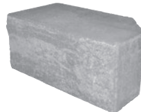
Square Foot Corner