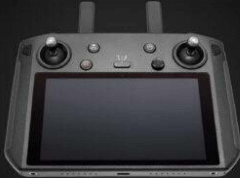
DJI SMART CONTROLLER