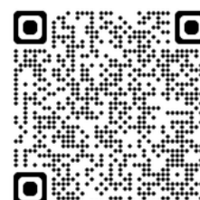
February 2025 Red Angus BREEDPLAN

Sire: SCHIPPS RED NAVIGATOR N25 (AI) (AMF) (MAF) (NHF) (OSF) SCHIPPS RED SILVER S04 (MAF) (NHF) (OSF) DC S04 --SCHIPPS RED CRYSTAL P06 --MILWILLAH MARBLE BAR J53 (AMF) (MAF) (NHF) (OSF) Dam: SCHIPPS RED EMPRESS N24 (AI) DC N24 --SCHIPPS RED EMPRESS G68