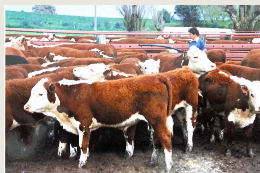
Sorting through a client's steers