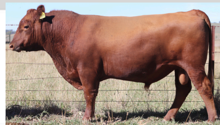
February 2025 Red Angus BREEDPLAN

Born: 06/05/2023 Tattoo: DC U09 --C-T GRAND STATEMENT 1025 (AMF) (MAF) (NHF) (OSF) Sire: YALLAMBEE GRAND STATEMENT Q40 (AI) (AMF) (MAF) (NHF) (OSF) YRAQ40 --YALLAMBEE GIA N19 --TRIPLE M LUNCH MONEY (ET) (AMF) (MAF) (NHF) (OSF) Dam: SCHIPPS RED WING Q44 DC Q44 --SCHIPPS RED WING K08