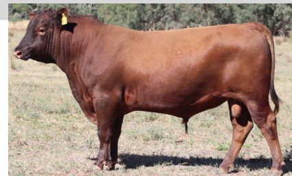
February 2025 Red Angus BREEDPLAN

Born: 06/05/2023 Tattoo: DC U10 --C-T GRAND STATEMENT 1025 (AMF) (MAF) (NHF) (OSF) Sire: YALLAMBEE GRAND STATEMENT Q40 (AI) (AMF) (MAF) (NHF) (OSF) YRAQ40 --YALLAMBEE GIA N19 --G A R DRIVE (BLACK) (AMF) (NHF) (OSF) Dam: DUNOON DANDLOO Q542 (BLACK) (AMF) (MAF) (NHF) (OSF) ANGBHRQ542 --DUNOON DANDLOO M1206 (BLACK)