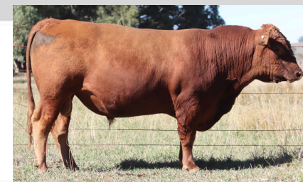
February 2025 Red Angus BREEDPLAN

Born: 08/05/2023 Tattoo: DC U16 --C-T GRAND STATEMENT 1025 (AMF) (MAF) (NHF) (OSF) Sire: YALLAMBEE GRAND STATEMENT Q40 (AI) (AMF) (MAF) (NHF) (OSF) YRAQ40 --YALLAMBEE GIA N19 --SCHIPPS RED NEVADA N16 (AI) (AMF) (MAF) (NHF) (OSF) Dam: SCHIPPS RED DOVE R29 DC R29 --SCHIPPS RED DOVE M74