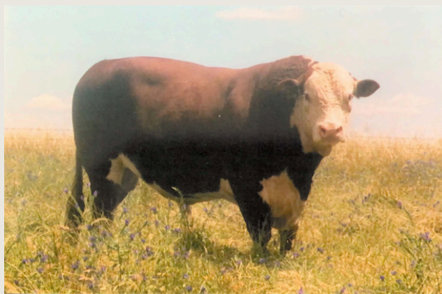
Doodle Cooma Quartz - A bull before his time. Large yet easy-fleshing.

NBRS Performance recording was commenced in 1976 along with the purchase of many renowned top sires and A.I programs using the best bulls available- Australian and International.