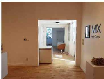
View through to small gallery

cold air return ---56"--- @ 31"h and 26"w