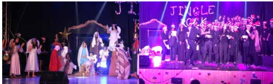
Jingle Rock, the campus Christmas Fest