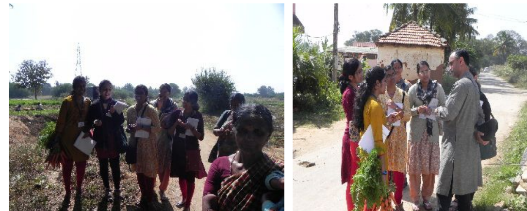
Interns posting in rural health care centres for 2 months

ensures that medical students get a broad based, yet in depth understanding of how to handle ethical dilemmas in patient care at a practical level. This exposure to Medical Ethics is provided from the day the student joins i.e., from Orientation day, to Foundation Course, throughout the student years right up to the lively Interns Friday Ethics Debates during internship. The Department is also involved in teaching medical ethics to our Allied Health Science and Health Administration students.