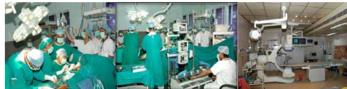
Well-equipped and well-staffed operation theatre complex and imaging facilities

In addition St. John's Laboratory Services inclusive of Clinical Microbiology, Clinical Biochemistry Pathology, Clinical Pathology and Genetics have excellent well-standardised, NABL accredited (since 2006) Service Laboratories . Most of the diagnostic tests are conducted on automated, advanced instruments and are monitored by a strict quality control and quality assurance programme. There is also a molecular diagnostic and research facility. A state of the art blood bank managed by the Department of Transfusion Medicine and Immunohematology provides services to patients including a large number of Haemophiliac patients, who have registered with the Hospital for regular blood transfusion.