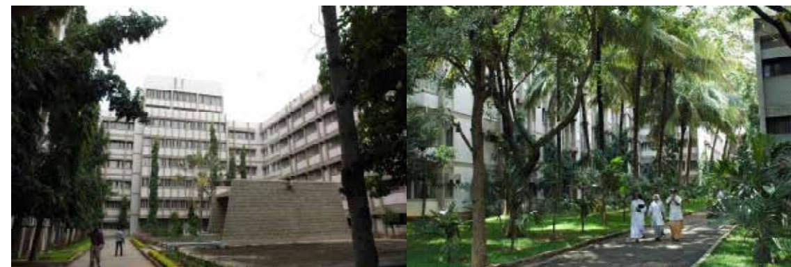
St. John's Medical College Hospital

St. John's Medical College Hospital which started out with a few hundred beds in 1975 currently has 1350 in-patient beds, distributed among 32 broad speciality and super speciality departments . Construction is underway to add another 750 beds so as to make it a total 2100 beds. The hospital is well equipped with out-patient and in-patient services and operation theatres for major and minor surgeries. Several sub-specialty clinics are run by various departments in order to provide focussed patient care. Notable among these is the Unit of Hope which provides a multidisciplinary team approach to treating children with physical impairments.