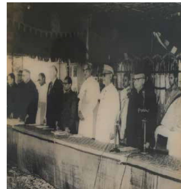
Dedication of the College by his Excellency Dr. Zakir Hussain, former President of India, 1968