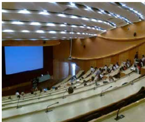
Pope Paul IV Auditorium, SJRI