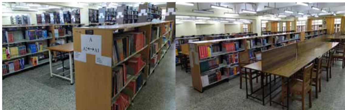
Zablocki Learning Centre (Central Library)