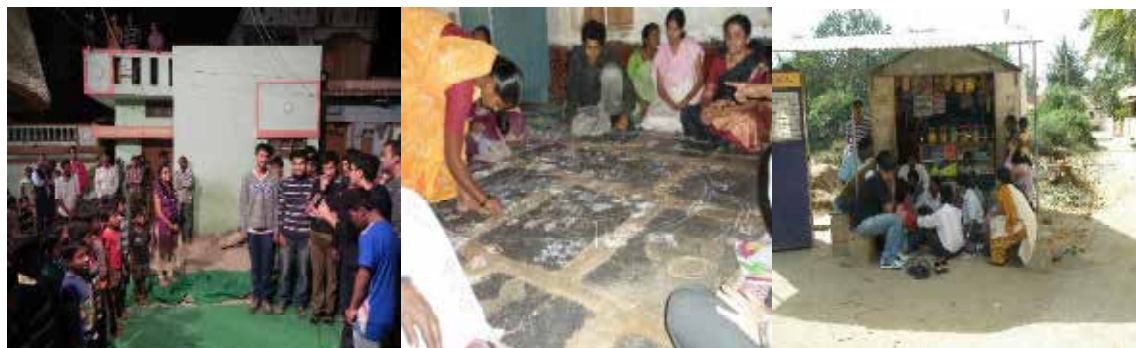
Rural Orientation Programme for the 1 st MBBS Students at the Institution's Community Health Training Centre at Mugulur

St. John's Medical College from its inception has been unique in emphasizing the importance of sensitizing medical students to medical ethics, even when it was not a 'syllabus requirement'. The Department of Medical Ethics with expert faculty from various departments and backgrounds