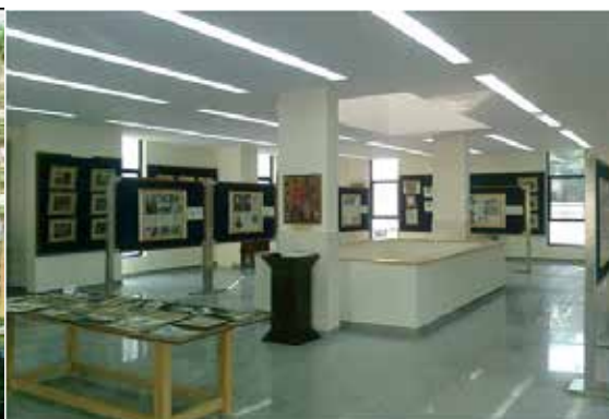
Major General S.L. Bhatia Museum of the History of Medicine