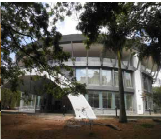
St. John's Main Auditorium