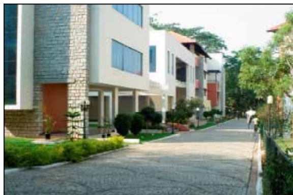
St. John's Research Institute

St. John's Research Institute (SJRI) is an integral part of St. John's National Academy of Health Sciences. It was conceptualized in the year 1998 and moved into the present facility in the year 2004. SJRI was set up with a commitment to pursue excellence in research and to build capacities in health-related research. The faculty of St. John's Medical College and Hospital are involved in research activities across various disciplines of medicine.