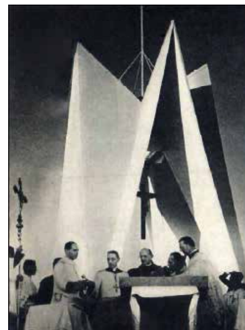
Blessing of the corner stone of the Medical College Project at the Eucharistic Congress in Mumbai, 3 December 1964

In the course of their Joint Pastoral letter issued in connection with the XXXVIII International Eucharistic Congress, held in Bombay in 1964, the Catholic Bishops of India, announced their choice of the College project as the Chief Memorial of the Congress. This choice received the warm approval of His Holiness, Pope Paul VI, which was conveyed by him in a special message addressed to His Eminence, Valerian Cardinal Gracias, the then President of the CBCI Society for Medical Education. His Holiness, also established a scholarship in the College in his own name, to be awarded, each year, to the best all-round student completing the MBBS course.