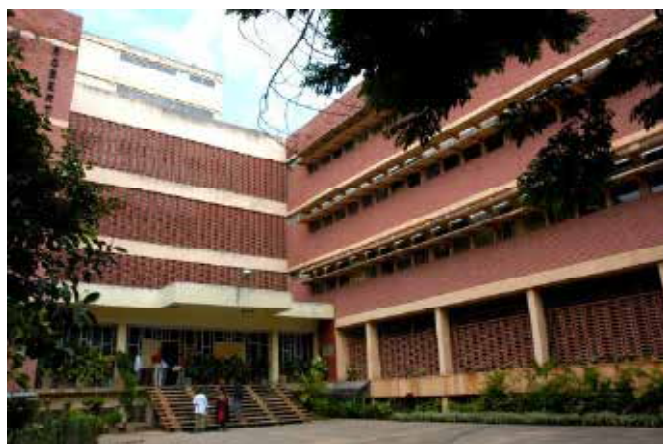
The College building - Robert Koch Bhavan in 1980