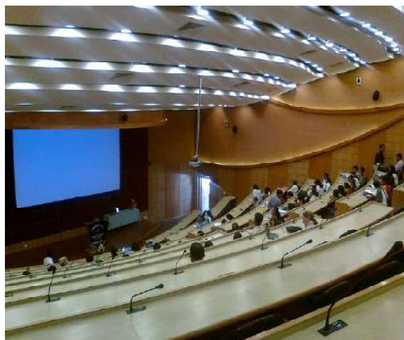
Pope Paul IV Auditorium, SJRI