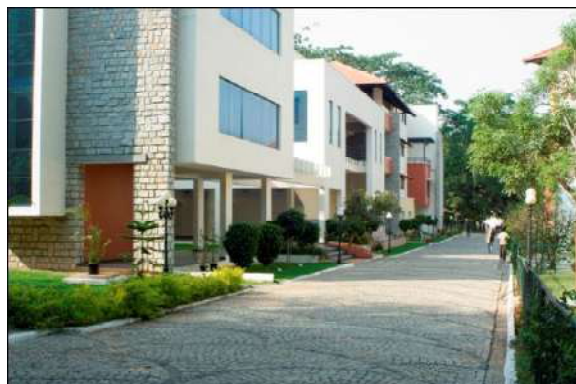
St. John's Research Institute

St. John's Research Institute (SJRI) is an integral part of St. John's National Academy of Health Sciences. It was conceptualized in the year 1998 and moved into the present facility in the year 2004. SJRI was set up with a commitment to pursue excellence in research and to build capacities in health-related research. The faculty of St. John's Medical College and Hospital are involved in research activities across various disciplines of medicine.