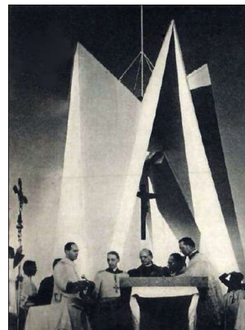
Blessing of the corner stone of the Medical College Project at the Eucharistic Congress in Mumbai, 3 December 1964

In the course of their Joint Pastoral letter issued in connection with the XXXVIII International Eucharistic Congress, held in Bombay in 1964, the Catholic Bishops of India, announced their choice of the College project as the Chief Memorial of the Congress. This choice received the warm approval of His Holiness, Pope Paul VI, which was conveyed by him in a special message addressed to His Eminence, Valerian Cardinal Gracias, the then President of the CBCI Society for Medical Education. His Holiness, also established a scholarship in the College in his own name, to be awarded, each year, to the best all-round student completing the MBBS course.