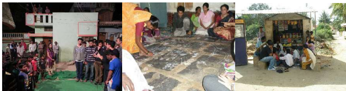
Rural Orientation Programme for the 1 st MBBS Students at the Institution's Community Health Training Centre at Mugalur

St. John's Medical College from its inception has been unique in emphasizing the importance of sensitizing medical students to medical ethics, even when it was not a 'syllabus requirement'. The Department of Medical Ethics with expert faculty from various departments and backgrounds