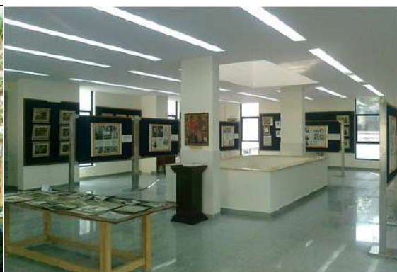
Major General S.L. Bhatia Museum of the History of Medicine