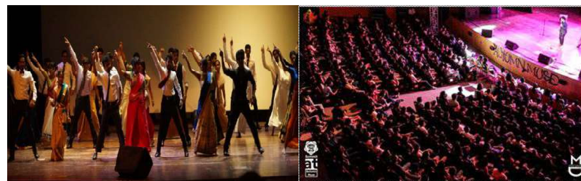
Autumn Muse, the Annual College Fest