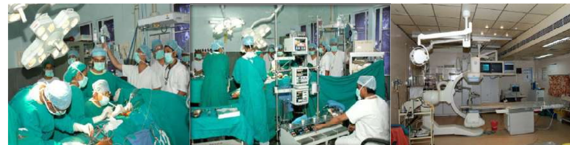
Well-equipped and well-staffed operation theatre complex and imaging facilities

In addition St. John's Laboratory Services inclusive of Clinical Microbiology, Clinical Biochemistry Pathology, Clinical Pathology and Genetics have excellent well-standardised, NABL accredited (since 2006) Service Laboratories . Most of the diagnostic tests are conducted on automated, advanced instruments and are monitored by a strict quality control and quality assurance programme. There is also a molecular diagnostic and research facility. A state of the art blood bank managed by the Department of Transfusion Medicine and Immunohematology provides services to patients including a large number of Haemophiliac patients, who have registered with the Hospital for regular blood transfusion.