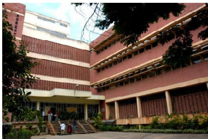
The College building - Robert Koch Bhavan in 1980