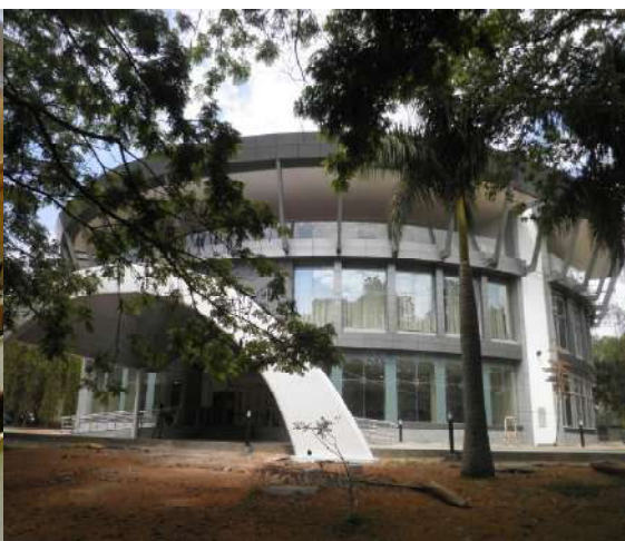
St. John's Main Auditorium