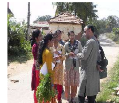
Interns posting in rural health care centres for 2 months