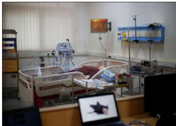
SIM - Man3 simulator for hands on training

The Primary goal of the DME is to promote innovation and advances in medical education. The Department is also the College's resource for expertise in medical education research. In addition the St John's DME is recognized as a Nodal Centre of Medical Council of India for MCI's Basic Workshop and the Advance Workshop in Medical Education Technologies.