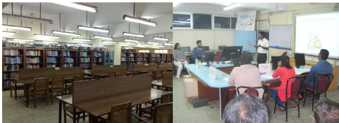
Zablocki Learning Centre (Central Library)