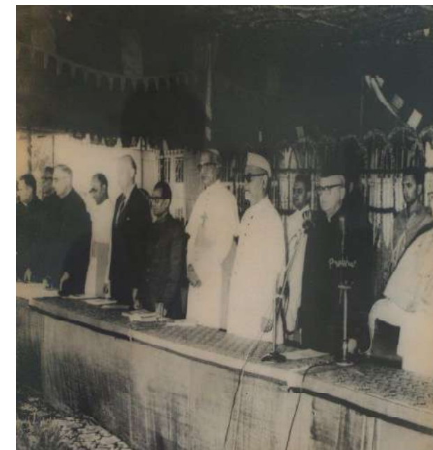
Dedication of the College by his Excellency Dr. Zakir Hussain, former President of India, 1968