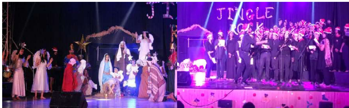
Jingle Rock, the campus Christmas Fest