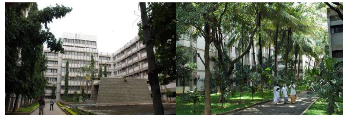
St. John's Medical College Hospital

St. John's Medical College Hospital which started out with a few hundred beds in 1975 currently has 1350 in-patient beds, distributed among 32 broad speciality and super speciality departments . Construction is underway to add another 750 beds so as to make it a total 2100 beds. The hospital is well equipped with out-patient and in-patient services and operation theatres for major and minor surgeries. Several sub-specialty clinics are run by various departments in order to provide focussed patient care. Notable among these is the Unit of Hope which provides a multidisciplinary team approach to treating children with physical impairments.