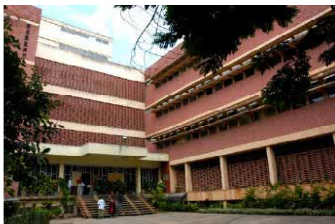
The College building - Robert Koch Bhavan in 1980