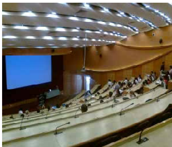
Pope Paul IV Auditorium, SJRI