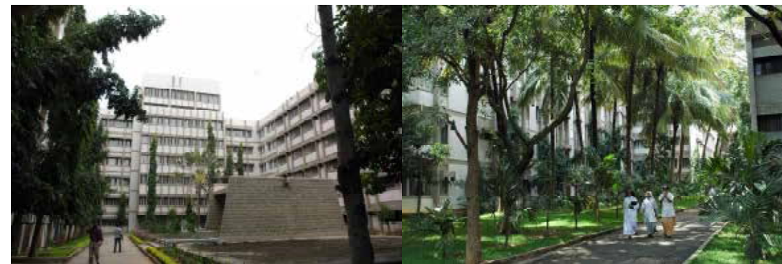
St. John's Medical College Hospital

St. John's Medical College Hospital which started out with a few hundred beds in 1975 currently has 1350 in-patient beds, distributed among 32 broad speciality and super specialty departments . Construction is underway to add another 750 beds so as to make it a total 2100 beds. The hospital is well equipped with out-patient and in-patient services and operation theatres for major and minor surgeries. Several sub-specialty clinics are run by various departments in order to provide focussed patient care. Notable among these is the Unit of Hope which provides a multidisciplinary team approach to treating children with physical impairments.