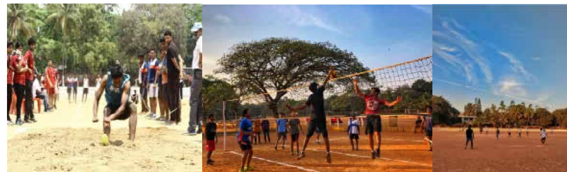
Annual Inter Class Sports

The annual Inter-Class Sports (ICS) tournaments held in the March-April every year are well attended and is followed by the Annual Sports day. Many students represent the University and also participate at state and national levels in various events. Since 1978, the SJMC Alumni Association also conducts the well known intercollegiate Dr. Isaac Abraham Memorial Hockey tournament.