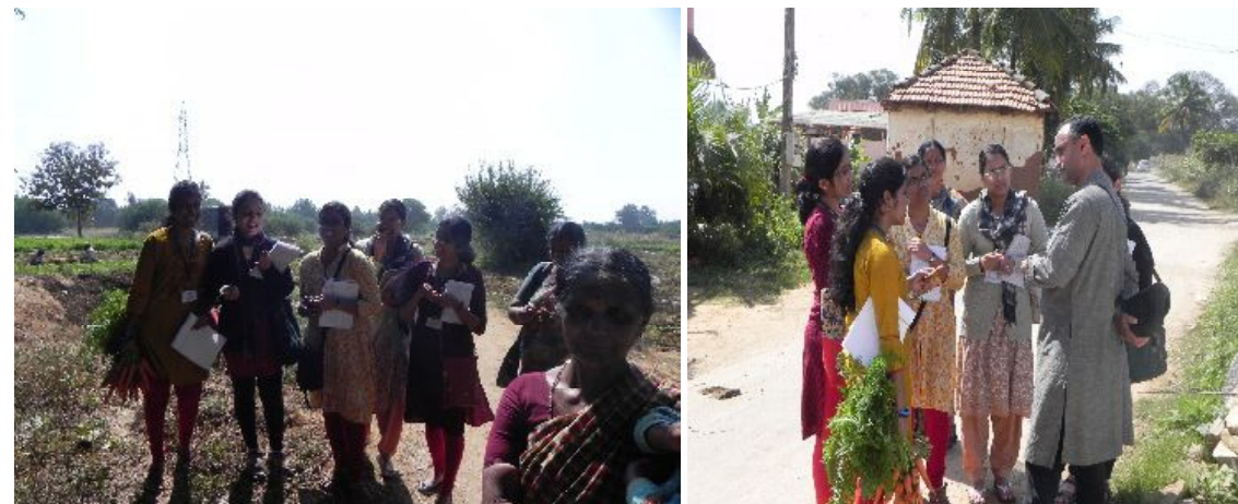
Interns posting in rural health care centres for 2 months