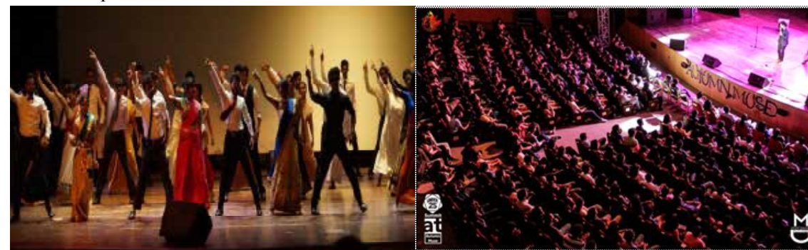
Autumn Muse, the Annual College Fest