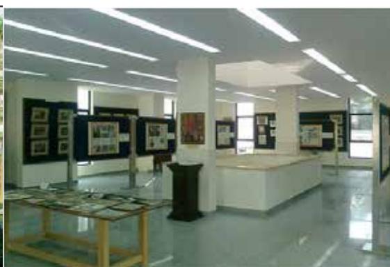
Major General S.L. Bhatia Museum of the History of Medicine