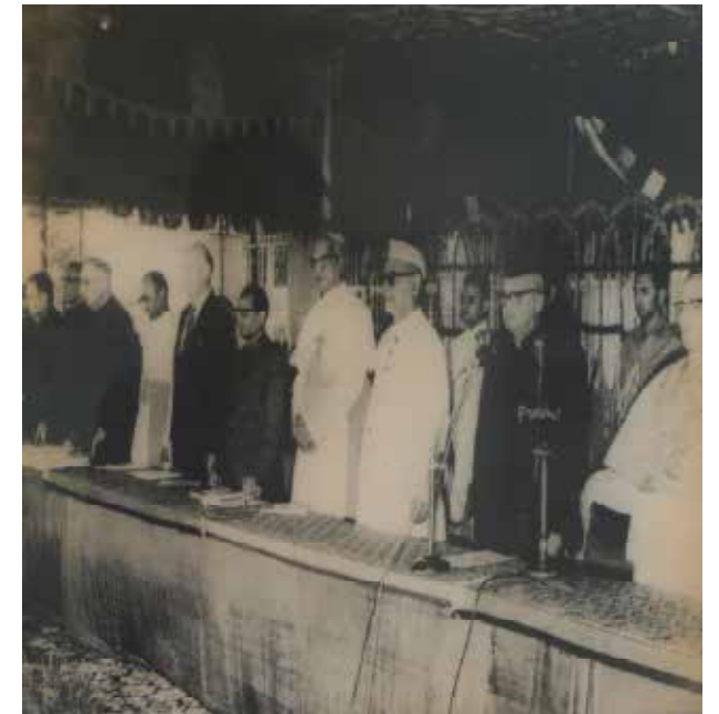
Dedication of the College by his Excellency Dr. Zakir Hussain, former President of India, 1968