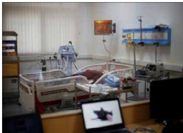
SIM - Man3 simulator for hands on training