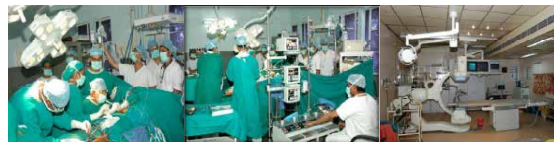
Well-equipped and well-staffed operation theatre complex and imaging facilities

In addition St. John's Laboratory Services inclusive of Clinical Microbiology, Clinical Biochemistry Pathology, Clinical Pathology and Genetics have excellent well-standardised, NABL accredited (since 2006) Service Laboratories . Most of the diagnostic tests are conducted on automated, advanced instruments and are monitored by a strict quality control and quality assurance programme. There is also a molecular diagnostic and research facility. A state of the art blood bank managed by the Department of Transfusion Medicine and Immunohematology provides services to patients including a large number of Haemophiliac patients, who have registered with the Hospital for regular blood transfusion.