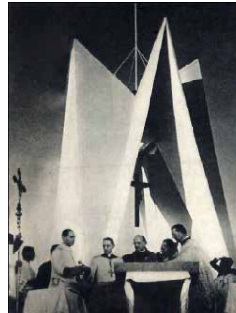
Blessing of the corner stone of the Medical College Project at the Eucharistic Congress in Mumbai, 3 December 1964

In the course of their Joint Pastoral letter issued in connection with the XXXVIII International Eucharistic Congress, held in Bombay in 1964, the Catholic Bishops of India, announced their choice of the College project as the Chief Memorial of the Congress. This choice received the warm approval of His Holiness, Pope Paul VI, which was conveyed by him in a special message addressed to His Eminence, Valerian Cardinal Gracias, the then President of the CBCI Society for Medical Education. His Holiness, also established a scholarship in the College in his own name, to be awarded, each year, to the best all-round student completing the MBBS course.