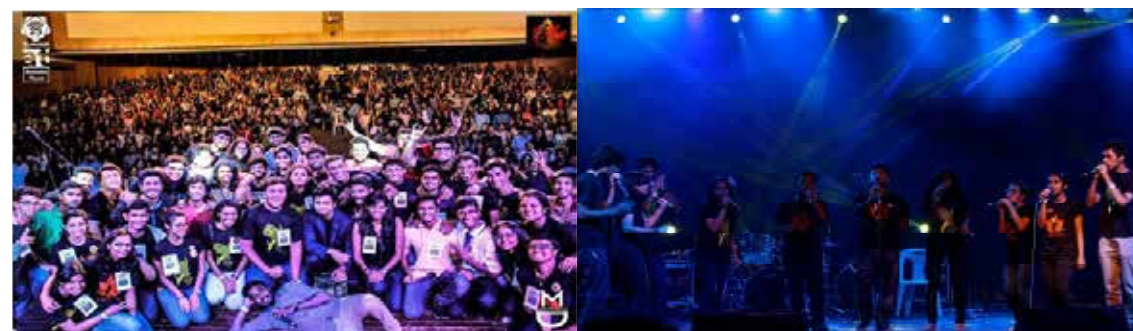
Student cultural activities