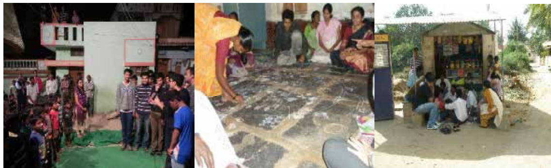
Rural Orientation Programme for the 1 st MBBS Students at the Institution's Community Health Training Centre at Mugalur

St. John's Medical College from its inception has been unique in emphasizing the importance of sensitizing medical students to medical ethics, even when it was not a 'syllabus requirement'. The Department of Medical Ethics with expert faculty from various departments and backgrounds ensures that medical students get a broad based, yet in depth understanding of how to handle ethical dilemmas in patient care at a practical level. This exposure to Medical Ethics is provided from the day the student joins i.e., from Orientation day, to Foundation Course, throughout the student years right up to the lively Interns Friday Ethics Debates during internship. The Department is also involved in teaching medical ethics to our Allied Health Science and Health Administration students.