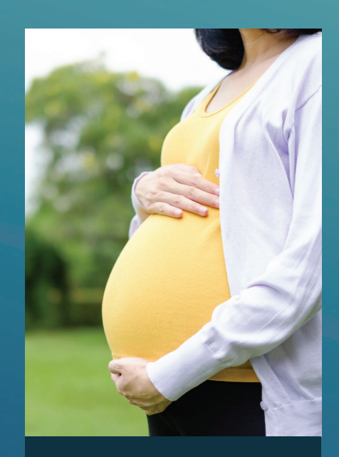
Pregnant women/ Menstruation