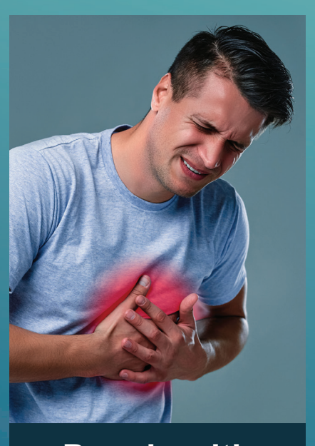
People with congenital heart and diseases