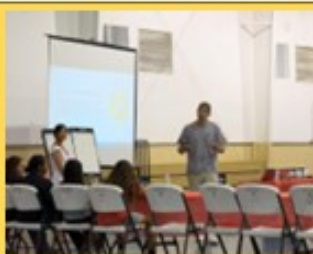
Music & Motivation Tribal Unite Youth Skills Class