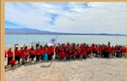
Missing Indigenous People Awareness Walk