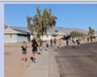
Community Wellness Walks