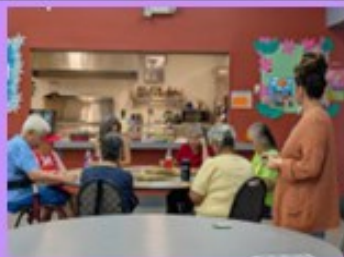
Monthly Elders Gathering