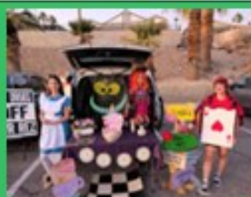
ASAP Trunk or Treat