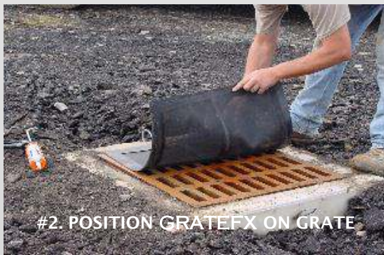
#2. POSITION GRATEFX ON GRATE