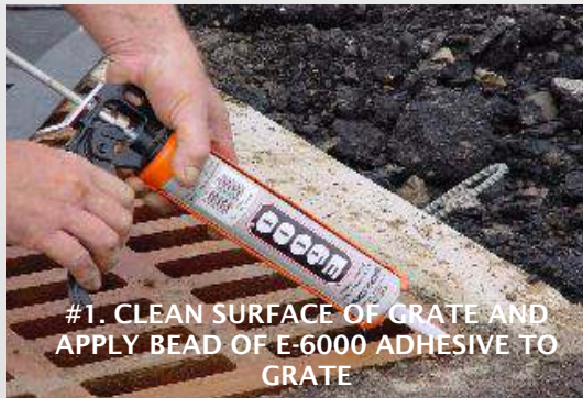
#1. CLEAN SURFACE OF GRATE AND APPLY BEAD OF E-6000 ADHESIVE TO GRATE

CAD and PDF files available for implementation in drawings.