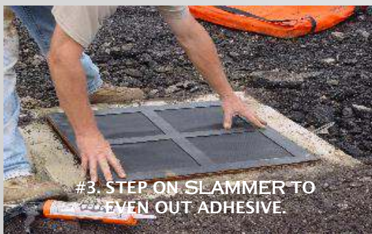
#3. STEP ON SLAMMER TO EVEN OUT ADHESIVE.