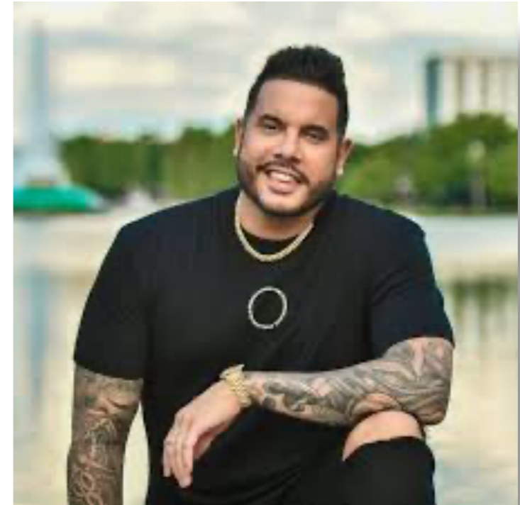
WJHM FM 102JAMZ ORLANDO RADIO HOST