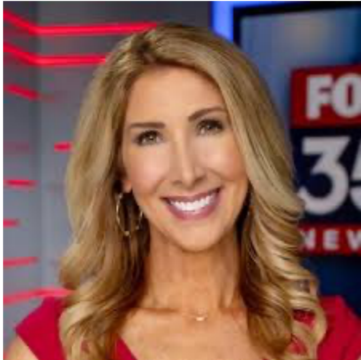
FOX 35 GOOD DAY ORLANDO HOST