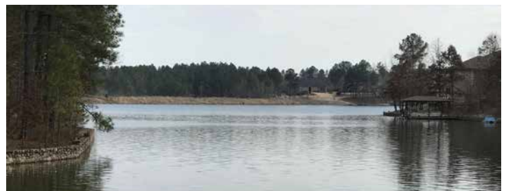
15 Serenar Way, Hot Springs Village: $53,000 MLS# 17005025, 0.36 Acre Lot