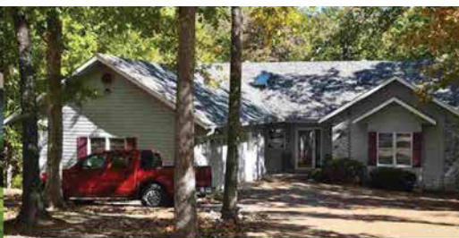
7 Nudo Lane, Hot Springs Village: $269,900 MLS# 17032469, 3 Bedrooms, 2.5 Baths, 1,792 Sq. Ft.