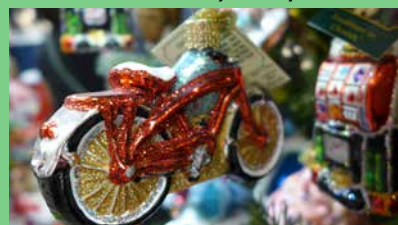
Kringles in the Park