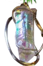
Necklace from Metaphysical Connection