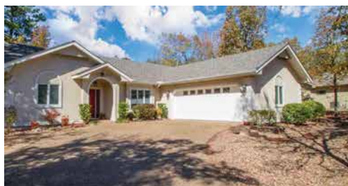
6 Herradura Way, Hot Springs Village: $219,900 MLS#16008139, 3 Bedrooms, 2 Baths, 2,150 Sq. Ft.