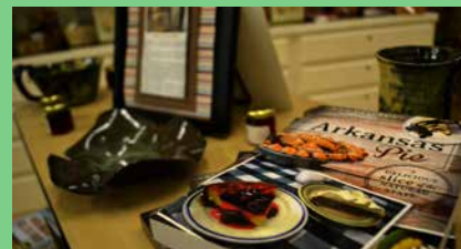
All Things Arkansas & Natural