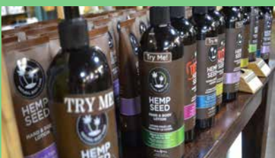
Earthbound Trading Co.