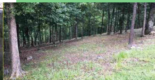
45 Binefar Way, Hot Springs Village: $29,500 MLS# 17026502, 0.51 Acre Lot