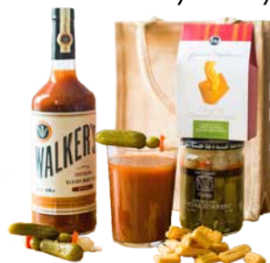
Hot Sauce from evilO