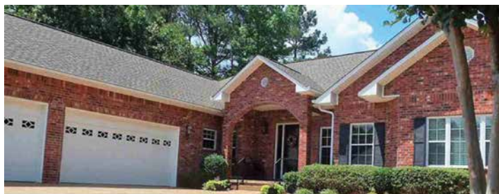
3 Sorprendente Lane, Hot Springs Village: $339,999 MLS# 17017067, 3 Bedrooms, 2 Bathrooms, 2,522 Sq. Ft.

364 Central Ave., 501-623-1333, EarthboundTrading.com A shopping safari, specializing in a wide range of multicultural merchandise from international artisans and suppliers. Personalized service in an atmosphere that celebrates adventure and travel.