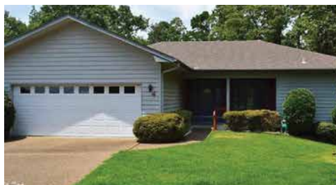
4 Berlanga Circle, Hot Springs Village: $189,900 MLS# 17024507, 3 Bedrooms, 2.5 Baths, 3,347 Sq. Ft.

The shop also carries items that are beautiful on their own, a tin of Crème Brûlée Almonds, Sweet & Spicy Glazed Pecans or a gift of Southern Pecan Toffee. They also have first press olive oils, air-shipped from Italy