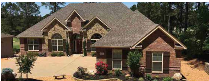
8 El Ejido Lane, Hot Springs Village: $339,900 MLS# 17006473, 3 Bedrooms, 2.5 Bathrooms, 2,705 Sq. Ft.

Take a class at the Coronado Fitness Center. With offerings like water yoga, Vinyasa yoga, dance fitness, step interval, indoor cycling, HIT cycle & pump, deep water aerobics, martial arts class, boxing fusion and Tai Chi.