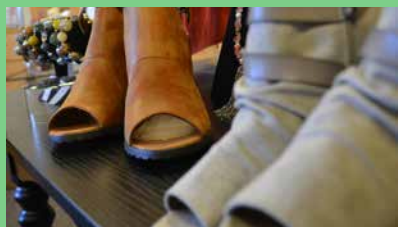
The Dogwood Tree