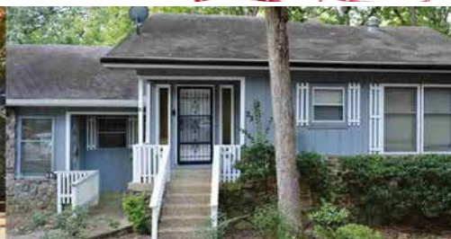
22 Macotera Place, Hot Springs Village: $99,500 MLS# 17027114, 3 Bedrooms, 2 Baths, 1,760 Sq. Ft.

JON SHERMAN: 501-922-8191 KATHY SHERMAN: 501-922-8277 HAMP WILSON: 501-209-6486