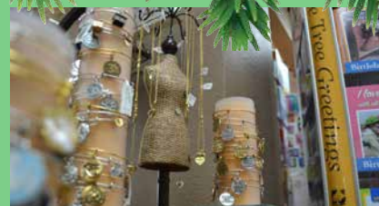
Annie’s Accents & Accessories

Have a furry family member? Then continued on pg. 14