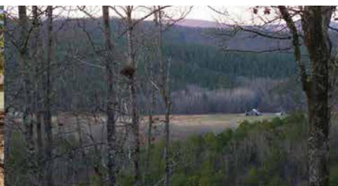
43 Binefar Way, Hot Springs Village: $34,500 MLS# 17026501, 0.66 Acre Lot