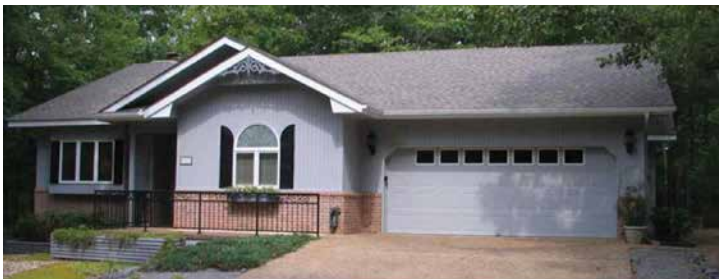
37 Huesca Way, Hot Springs Village: $192,500 MLS# 17023956, 4 Bedrooms, 3 Bathrooms, 2,364 Sq. Ft.

Let your dogs have some off-leash playtime at the DeSoto Dog Park in Hot Springs Village. The gated park is open daily from dawn to dusk, providing a place for well behaved and healthy dogs to run and play. The park is located on DeSoto Park Drive at the base of the Lake DeSoto dam just off DeSoto Blvd. and Toledo Dr. For more information, go to HSVDogPark.org .