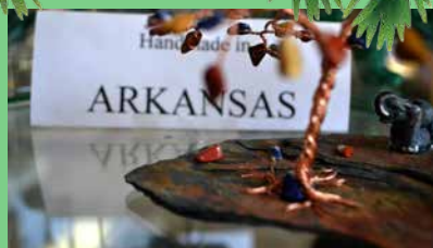
DeSoto Rock Shop