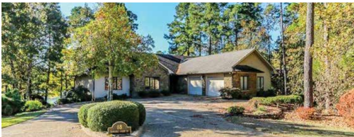
18 Sanchez Ct., Hot Springs Village: $525,500 MLS# 17030290, 4 Bedrooms, 3.5 Bathrooms, 4,430 Sq. Ft.

To learn more, go to Rei.com/learn/expert-advice/winter-snow-camping-checklist.html . ✱