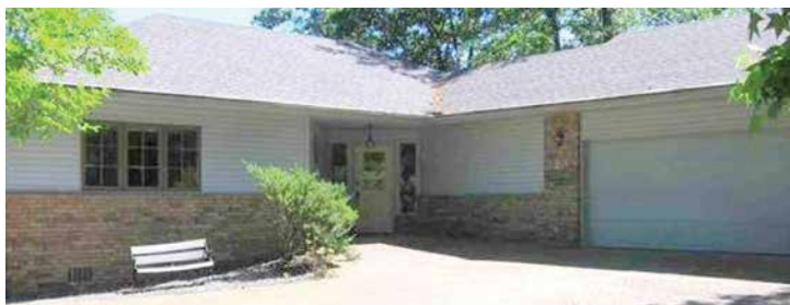
23 Talana Circle, Hot Springs Village: $324,900 MLS# 17014481, 3 Bedrooms, 3.5 Bathrooms, 2,879 Sq. Ft.