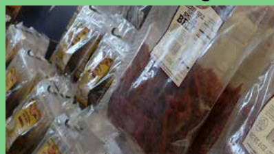
The Jerky Shop