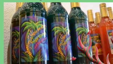
Spa City Tropical Winery & Gifts