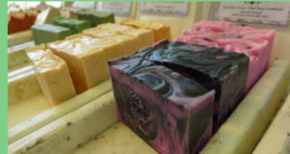
The Bath Factory