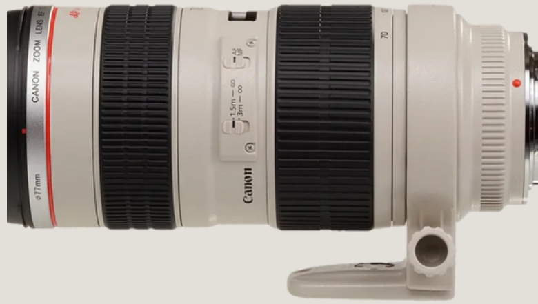
Canon EF 70-200mm f/2.8L IS II - 60 - 90,000 UGX