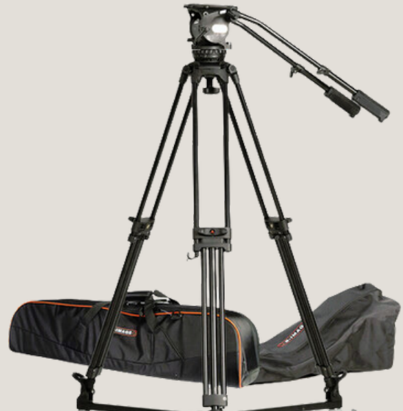
E-Image EG10C2 Medium Tripod