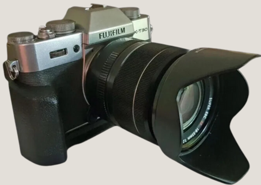
FUJIFILM X-T30 with 18-55mm lens - 100.000 UGX

The FUJIFILM X-T30 is a versatile mirrorless camera distinguished by advanced stills and video recording characteristics.