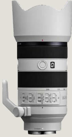
Sony FE 70-200mm f/4 G OSS Zoom Lens E-Mount 60 - 90,000 UGX