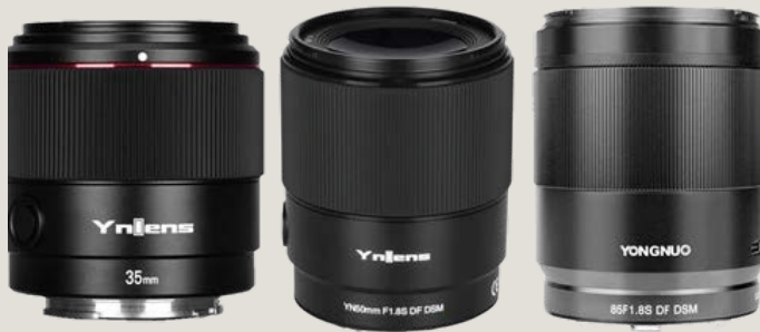
Yongnuo YN 35mm f/2, 50mm f/1.8, 85mm f/1.8 200,000 - 250,000 UGX