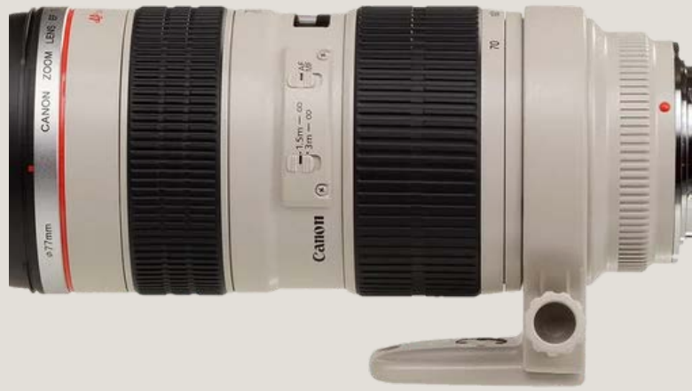
Canon EF 70-200mm f/2.8L IS II - 60 - 90,000 UGX