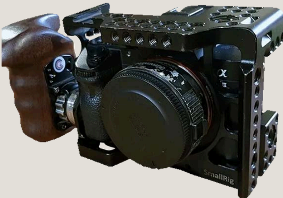
Sony Alpha a7 III - 150.000 UGX