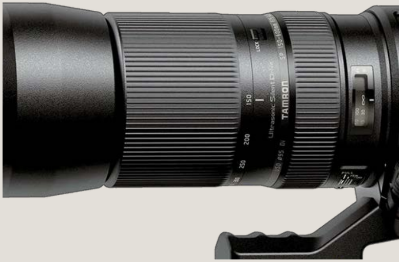
Tamron SP 150-600mm f/5-6.3 - 50 - 70,000 UGX