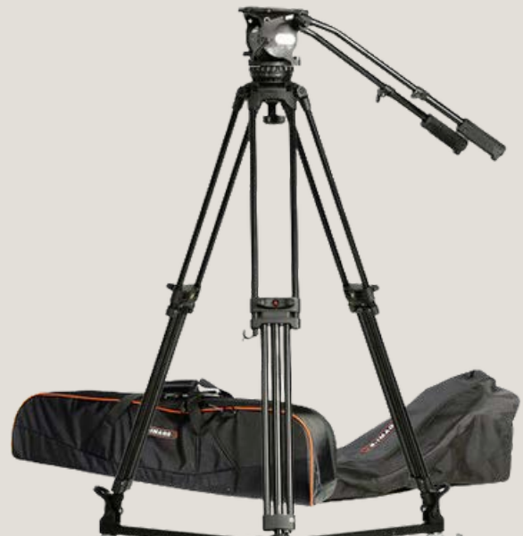
E-Image EG10C2 Medium Tripod