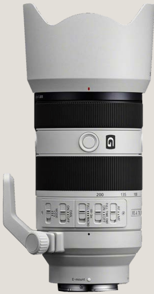
Sony FE 70-200mm f/4 G OSS Zoom Lens E-Mount