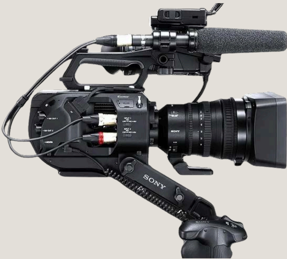
Sony PMW-FS7 MKII; Body, Rig, Batteries, Lens and Memory - 400,000 UGX

Super 35mm sized sensor for nice depth of field. Stronger locking E-mount that is fully compatible with E-Mount lenses, and supports all electronic connections. The locking mount reduces lens play, and allows you to use most 35mm lenses including PL, EF, Leica, and Nikon via optional adapters.