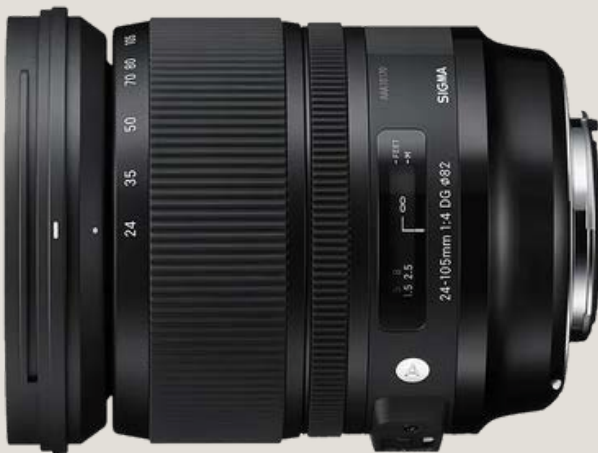
Sigma 24-105mm f/4 DG OS HSM Art - 50 - 70,000 UGX