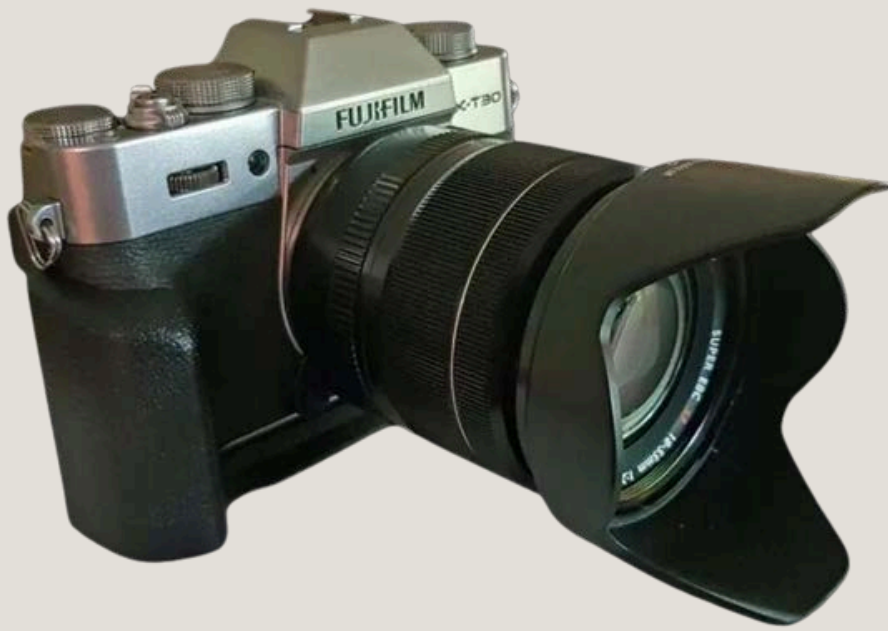
FUJIFILM X-T30 with 18-55mm lens - 100.000 UGX

The FUJIFILM X-T30 is a versatile mirrorless camera distinguished by advanced stills and video recording characteristics.