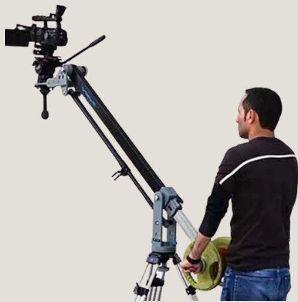
Heavy 6FT JIB 100,000 UGX

Jib 6ft for heavy cameras, with manual pan and tilt head.