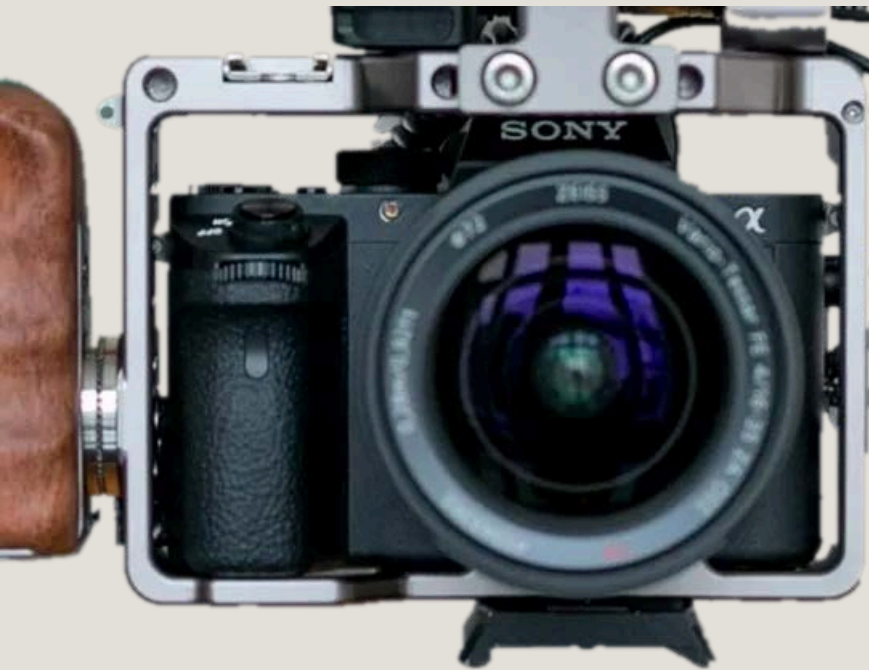
Sony Alpha a7R II - 100.000 UGX