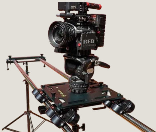
12FT Heavy slider 120,000 UGX