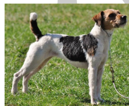
Ruckerhill Moxie JRTCA Bronze Reg:0049-12A Color:12" Tri Broken DOB:12/30/2010 COI:1.5625%