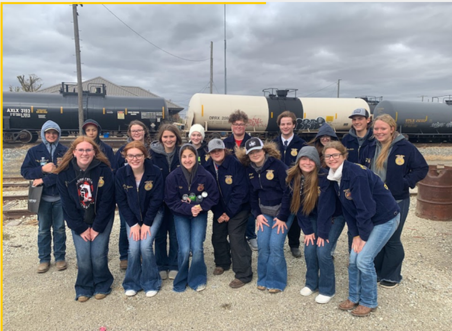
We had 16 High School FFA Members come and hand out food and snacks along with two Middle School FFA Members.

Farmer's Appreciation is a national holiday that is used to show appreciation to farmers who raise and make our food. Without farmers, the world wouldn't be as advanced or have as much food as we have now. So, to show our appreciation to those farmers, we set up a booth at Consolidated Grain & Barge. At this booth, we hand out McDonald's burgers, chips, cookies, drinks, and handouts from multiple seed companies and agricultural companies. Some of those companies that sponsored us this year was Becks Hybrids, Koenig Equipment, and Stine Seed Co. Thank you for your help!!! Not only did we have multiple companies help us, but we had 15 CHS FFA members and 2 CMS FFA members come together to hand out those goodie bags! Thank you everyone that came out and showed their appreciation towards our local farmers!