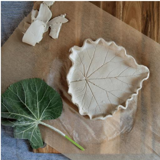
Sprouting Wild Ones at https://sproutingwildones.com/leaf-imprint-jewelry-dish/