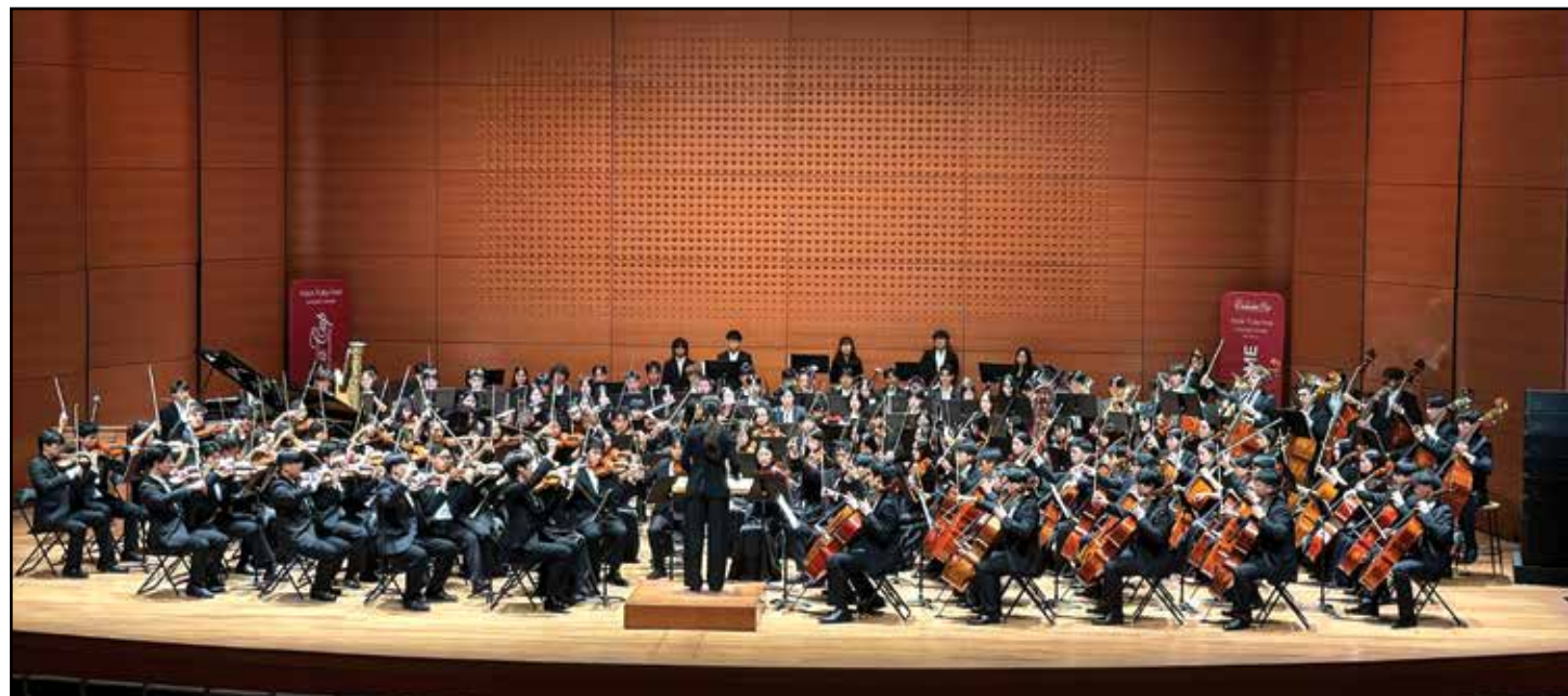
Group On-stage Photo (Alice Tully Hall)