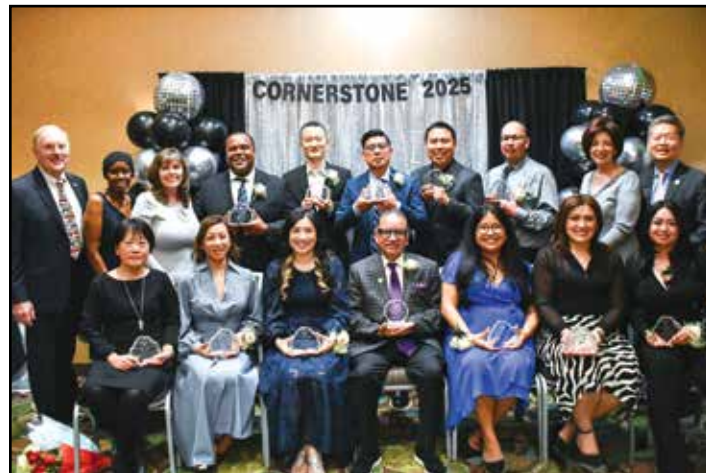
The 12 Cornerstone Award recipients with the WVUSD Board of Trustees