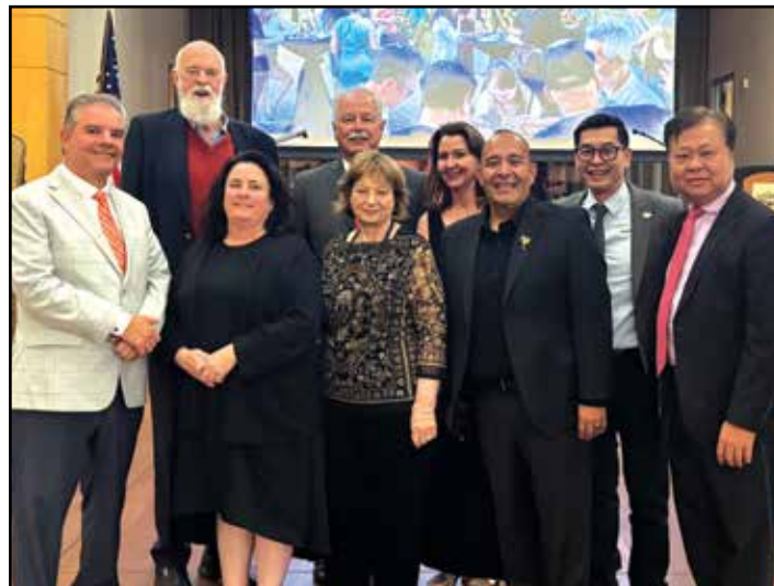
DBC Board at Winter Gala