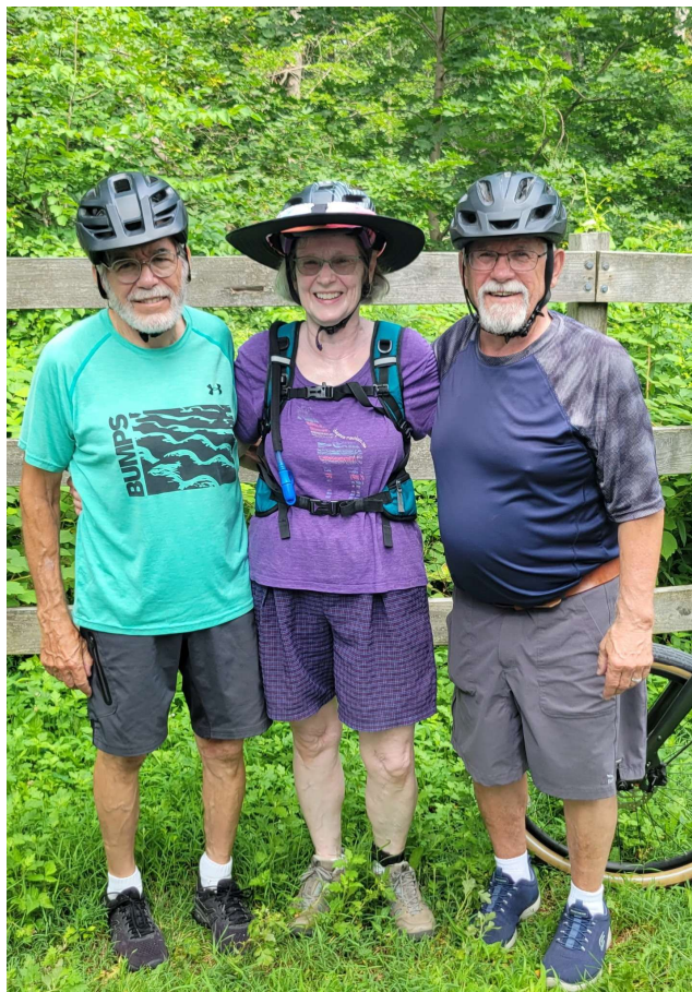
Ptarmigan Bike Ride on Saucon Trail - July 12