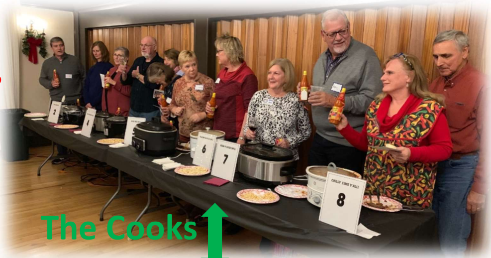
The Cooks ↑