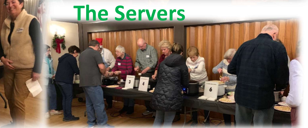
Some Chili Eaters