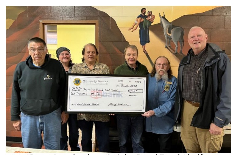
Donation check to Jericho Road Food Shelf