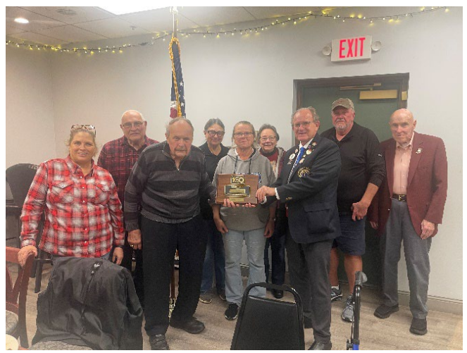
Richfield Lions' Model Club Campaign 100