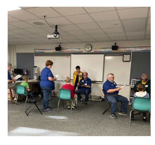
KidSight Screening at Orono Elementary & Intermediate Schools.

Lions from St. Louis Park, Edina, Maple Grove & Orono.