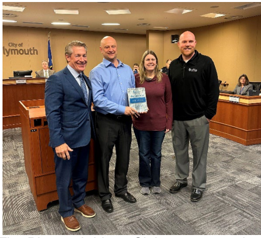
The Plymouth Lions Club was recognized as 2023 Platinum Sponsors by the Plymouth Parks and Recreation Department during a recent City Council meeting.

Their financial and in-kind support helped sponsor more than a dozen free programs and community events throughout the year.