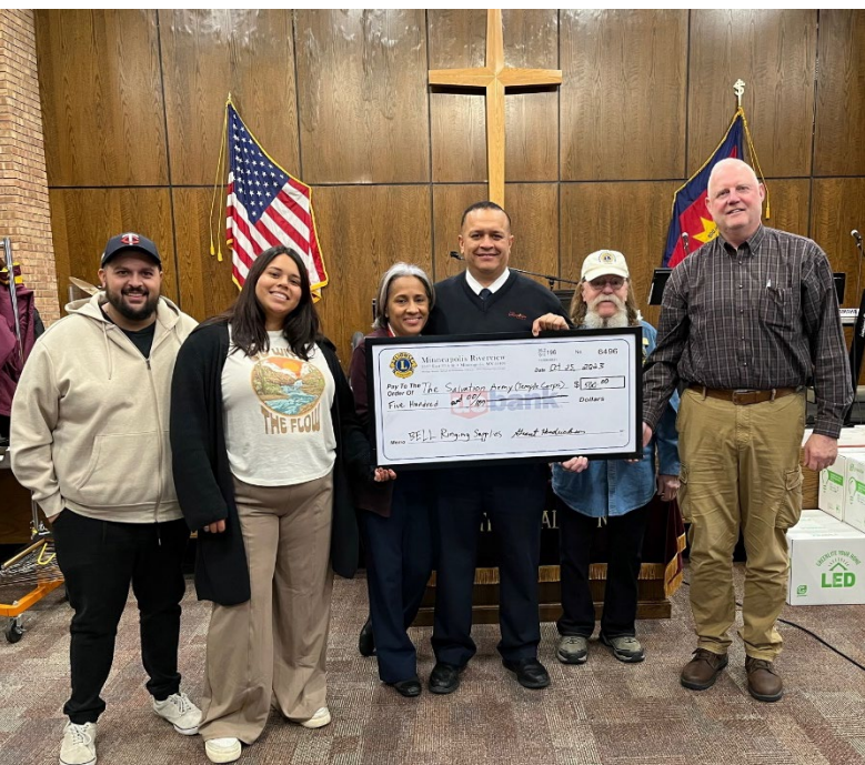
Mpls Riverview Lions donation check to the Salvation Army (Temple Corps) for bell ringing supplies, hats, gloves, hand warmers Santa hats and beards.