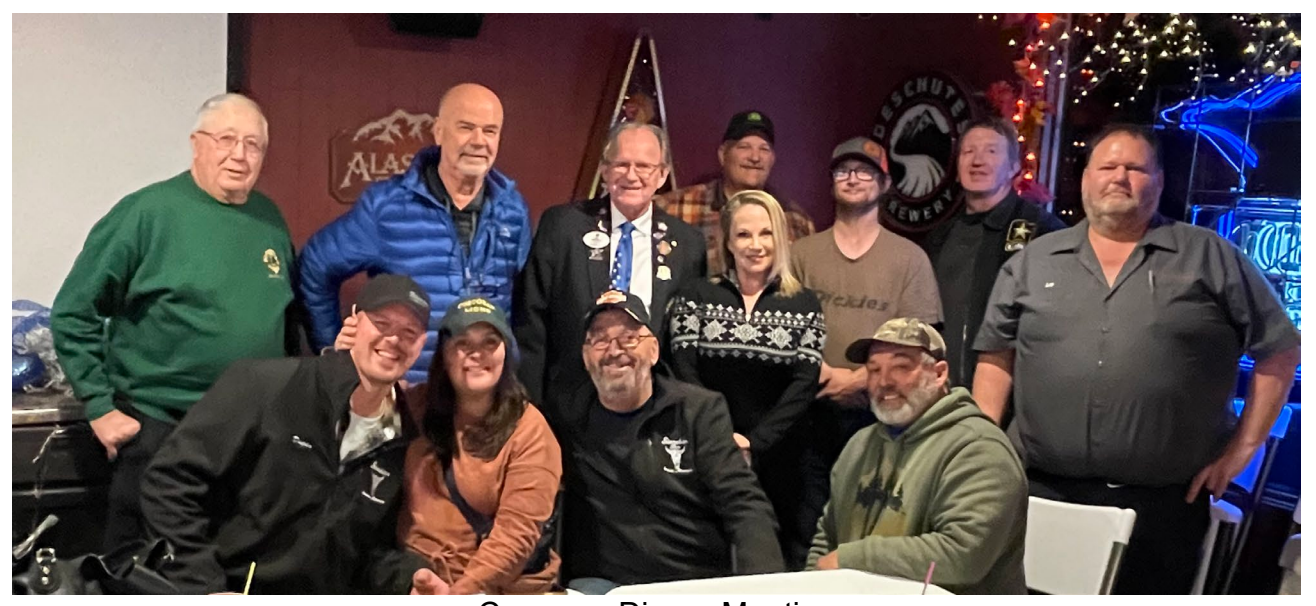
Corcoran Dinner Meeting