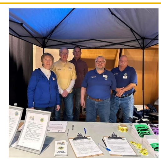
Maple Grove Lions Breakfast with Santa