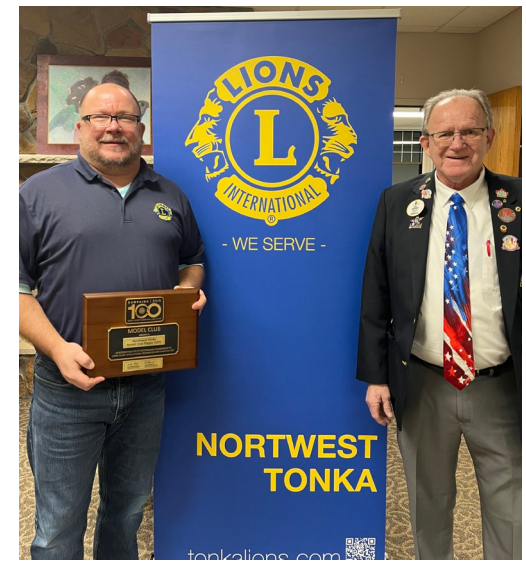
Campaign 100 Model Club Presentation to Northwest Tonka Lions