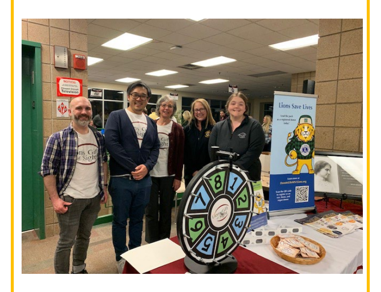
Beer & Wine Tasting including Lions Gift of Sight (highligthed at the event.)