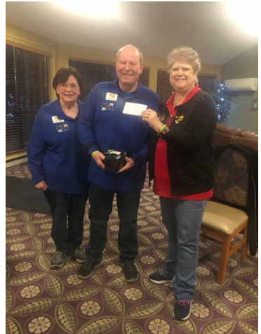
KidSight made a presentation to the Brooklyn Center Lady Lions