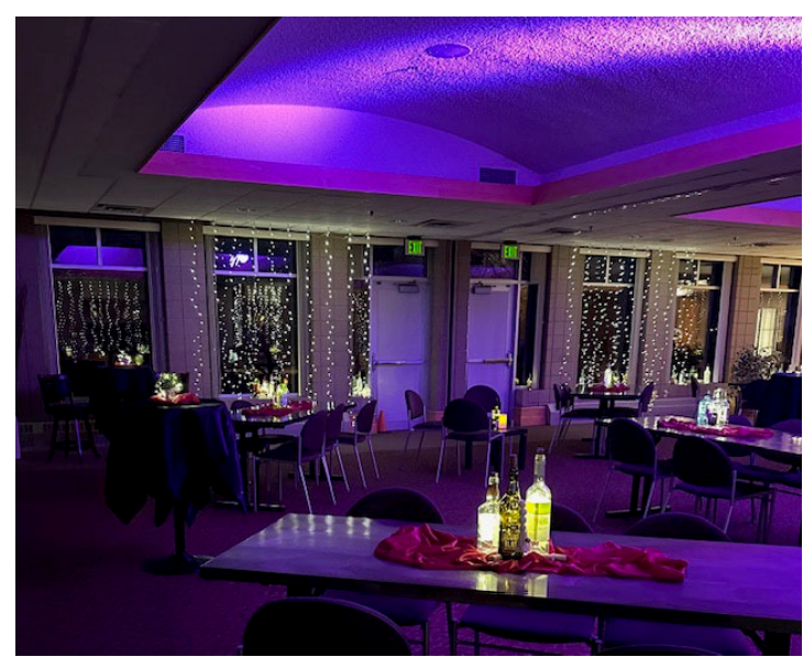
Lions Lounge-a new feature of the envent inluded a singer and VIP Experience