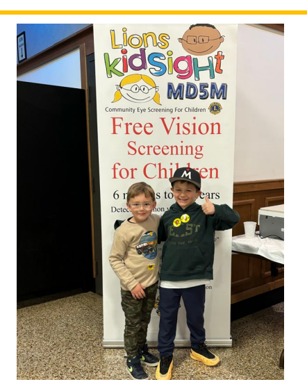
KidSight screening at the Bloomington Lions Pancake Breakfast