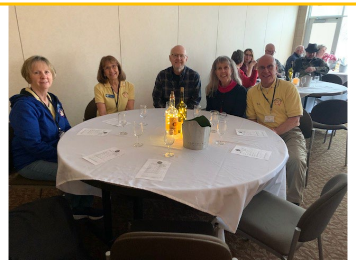
Maple Grove Lions attending the event