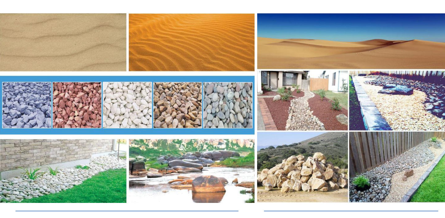
White Gravel, Red Gravel, Beige Gravel, Grey Gravel, Road base, Sub base