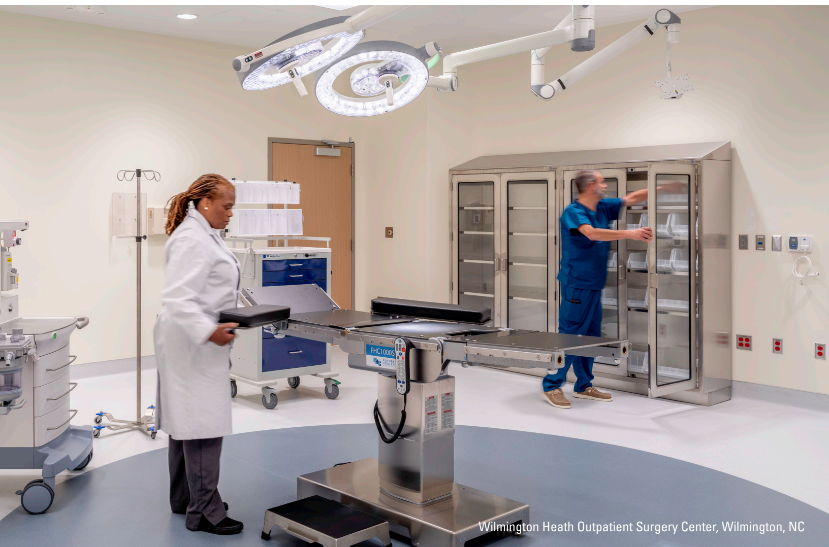
Wilmington Heath Outpatient Surgery Center, Wilmington, NC

Partnering with you to deliver hopeful, healing and healthy environments.