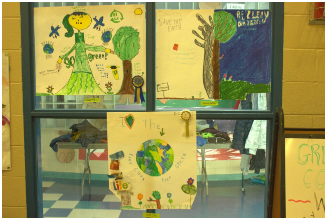
The three winning posters are top left, first place; top right, second place; and bottom, third place.