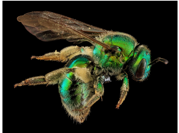
Shiny, bright, and showy Augochloropsis metallica metallica

Bees comprise numerous species within the wasp family. The most common, found everywhere, is Augochlorella aurata . Its cousin, Augochloropsis metallica metallica (pictured), looks metallic, is bright green, and very visible. About 100 species can be found any place in Maryland; many are very small and you do not notice them unless you are in their field. There can be 26,000 bees to an acre. Native bees are not bad stingers because they can’t penetrate skin on adults’ hands; their venom is weak and most people are not allergic to them.