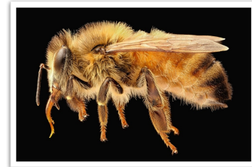
Apis mellifera

More than 400 species of bees have been documented in Maryland. Bees are extremely beneficial insects that are responsible for pollinating many different species of flowering plants. Bees also serve as an important food resource for some species of wildlife.