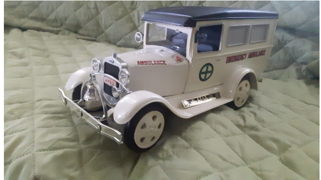
Collector's Item: Jim Beam toy ambulance, containing 1.75 liter whisky bottle never opened (licensed and stamped). 17" long × 6½" wide × 7½" high

You can make an offer to purchase any or all of these items for the benefit of DACA. Please send email to info@daca-md.org for any additional information.