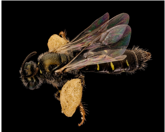
Perdita bradleyi, one of the bees caught in the sand barrens habitat at Jug Bay, with pollen loads on her hind legs.