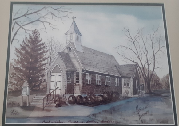
The original Holy Family Catholic Church on Central Avenue (1977) (now their chapel). Frame 19" × 16"