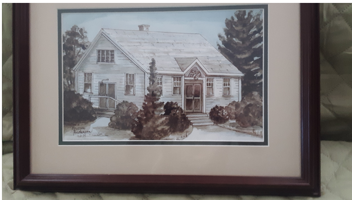
The Community Hall (1921–1977) owned by All Hallows Episcopal Parish, located between the store and the Rectory. It served as a meeting place for all community events—dinners, dances, polling place, plays, piano lessons and recitals, fund raising fairs, and more. Frame 17" × 13"