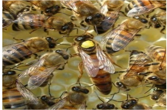
The Queen wears a bright spot and stands out among her worker “subjects.”

Anne Arundel County Ask-A-Master Gardener Plant Clinics will be held at the Anne Arundel Co. Farmers Market at Riva Road and Harry S. Truman Parkway, Saturdays, April 16–October 8, 8:00 am–12:00 pm, and at the Crofton Library, 1681 Riedel Road, Saturdays, April 15–October 15, 10:00 am–1:00 pm.