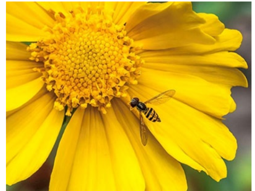
Honeybee on a flower