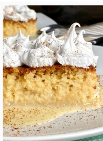
3 LECHEs CAKE