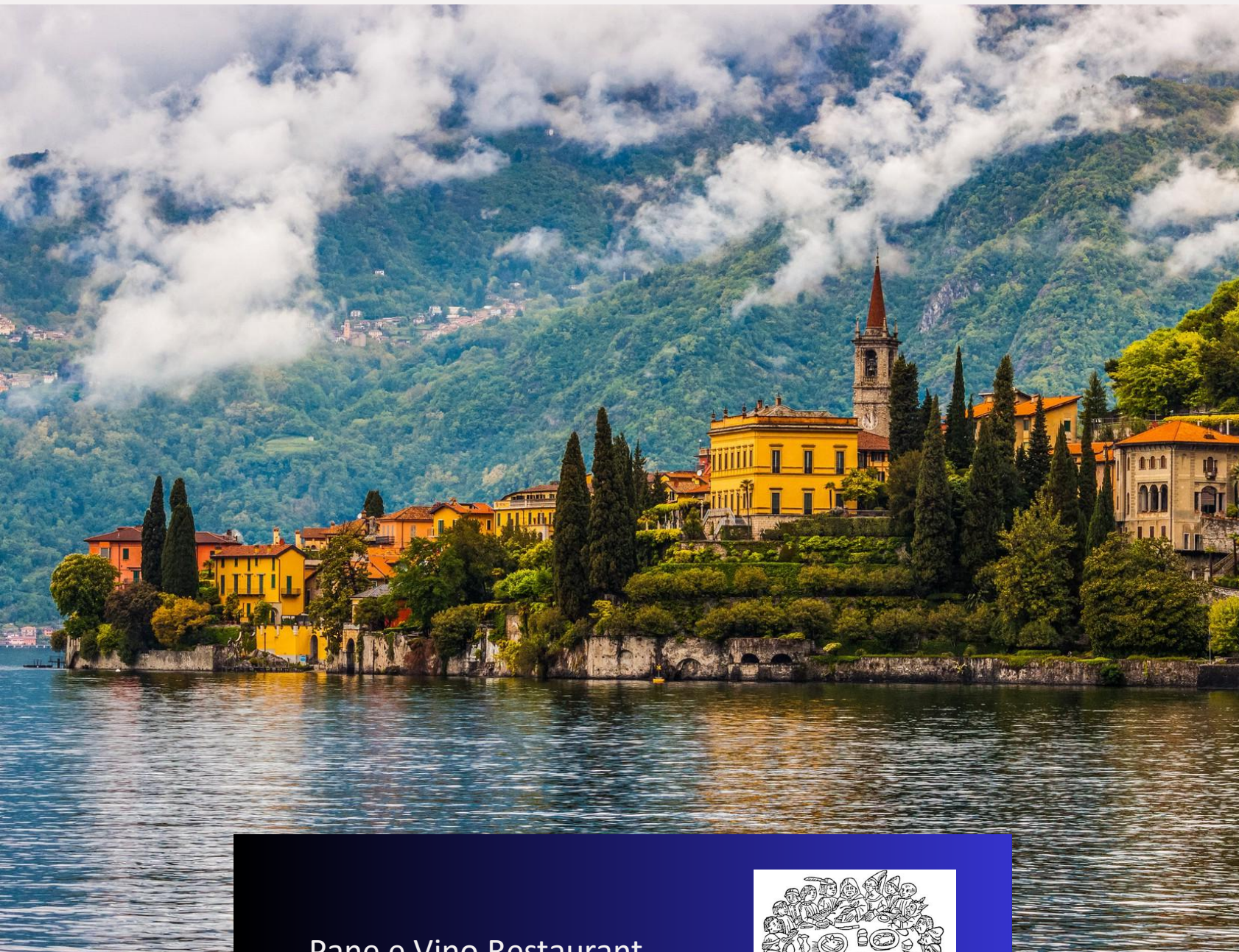
Pane e Vino Restaurant