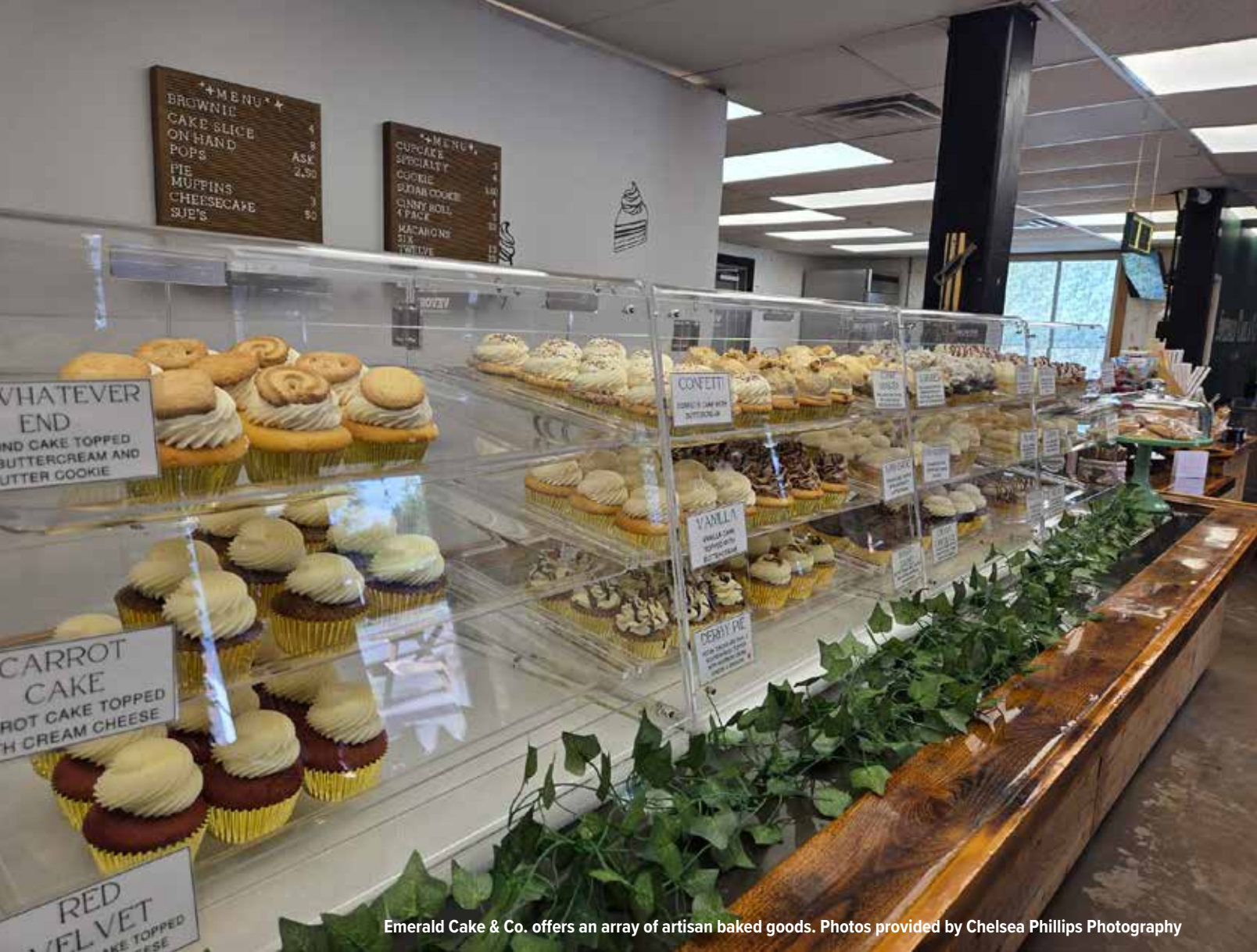
Emerald Cake & Co. offers an array of artisan baked goods.