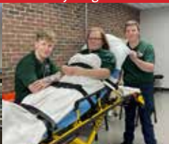
Emergency Medical Technology