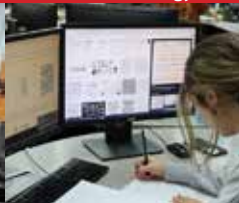
Digital Graphic Design