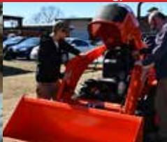
Forestry & Agriculture