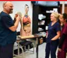
Patient Care Technician