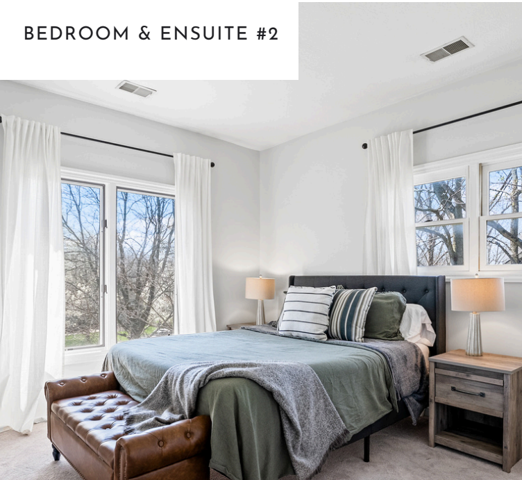
BEDROOM & ENSUITE #2