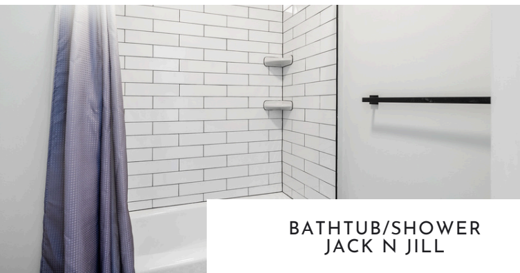
BATHTUB/SHOWER JACK N JILL