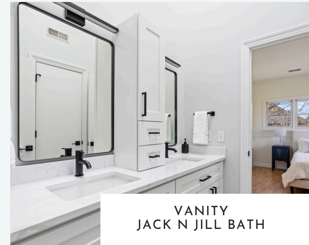
VANITY JACK N JILL BATH