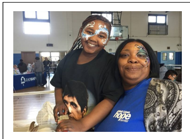
2017 Community Health Fair

For more info, contact Dan at (716) 893-7222 x306 for more information.