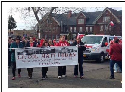
Matt Urban staff marching in the parade.