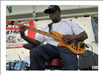
Musicians at National Night Out

Our annual Neighborhood Cleanup brought together volunteers, residents, and business to provide a clean, healthy and safe environment for the Community in which we live, play and work. We're look-