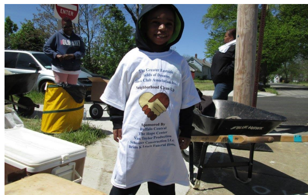
Volunteers from the 2017 Neighborhood Clean-Up event.