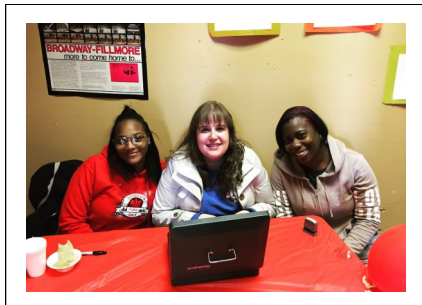
Volunteers at the Hope Center fundraiser.