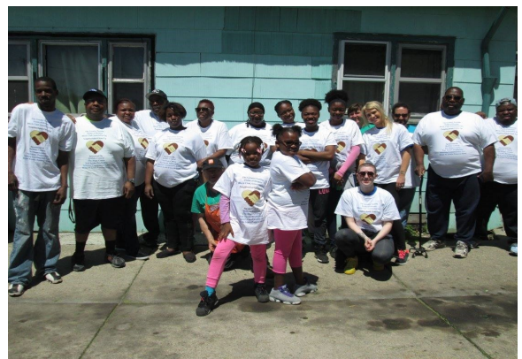
Greater East Side Fields of Dreams Block Club, 2017

Our purpose is to initiate and implement charitable programs beneficial to the community and to unite in