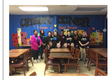
Volunteers at the Urban Diner