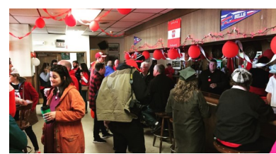
Dyngus Day crowd at Hope Center party.

working hard here in the neighborhood every day to provide individuals and families with the resources they need. We thank all of our staff, volunteers and visitors for making our fundraiser a success!