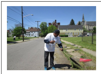
Volunteer at 2017 Cleanup Event