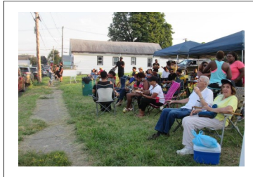
Residents enjoy National Night Out

Our National Night Out honored our Community Police Officers and our C-District Police whom we work together with to create a safe environment, and gave the community a chance to meet and greet one another along with music, fun activities, and food.