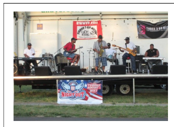
National Night Out Event