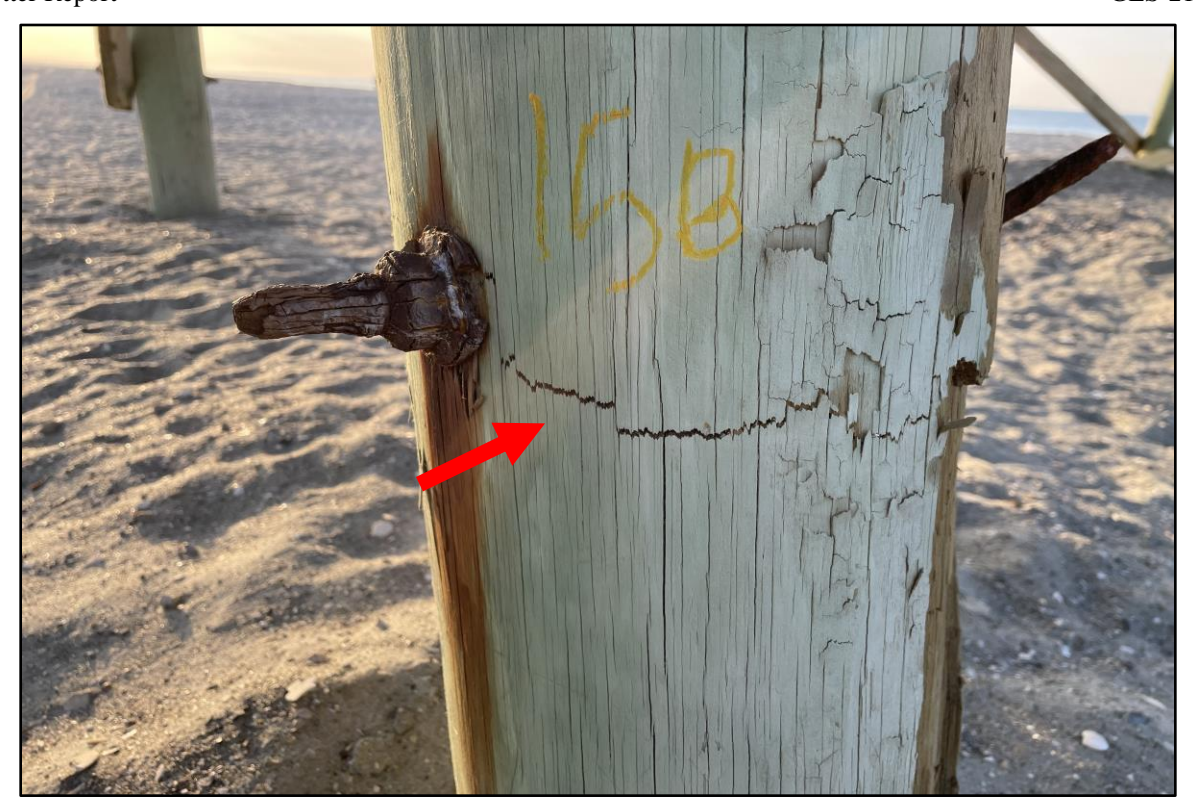
Photograph 5: Pile 15B – Pile fractured