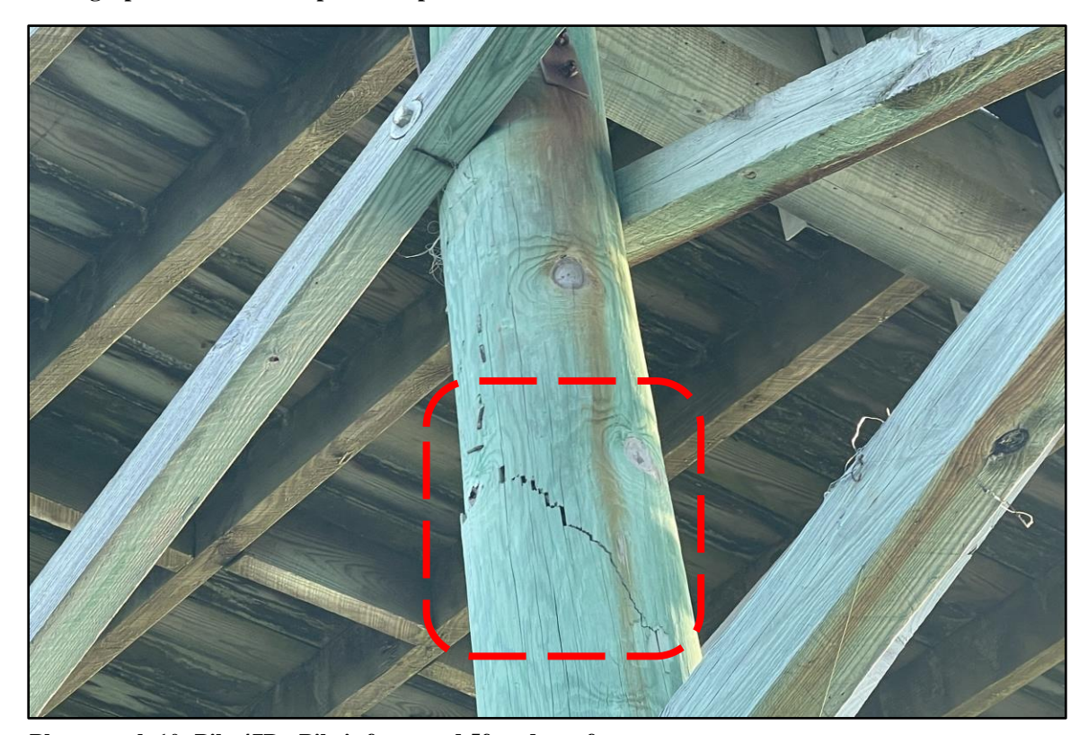
Photograph 10: Pile 47B - Pile is fractured 5feet down from top.