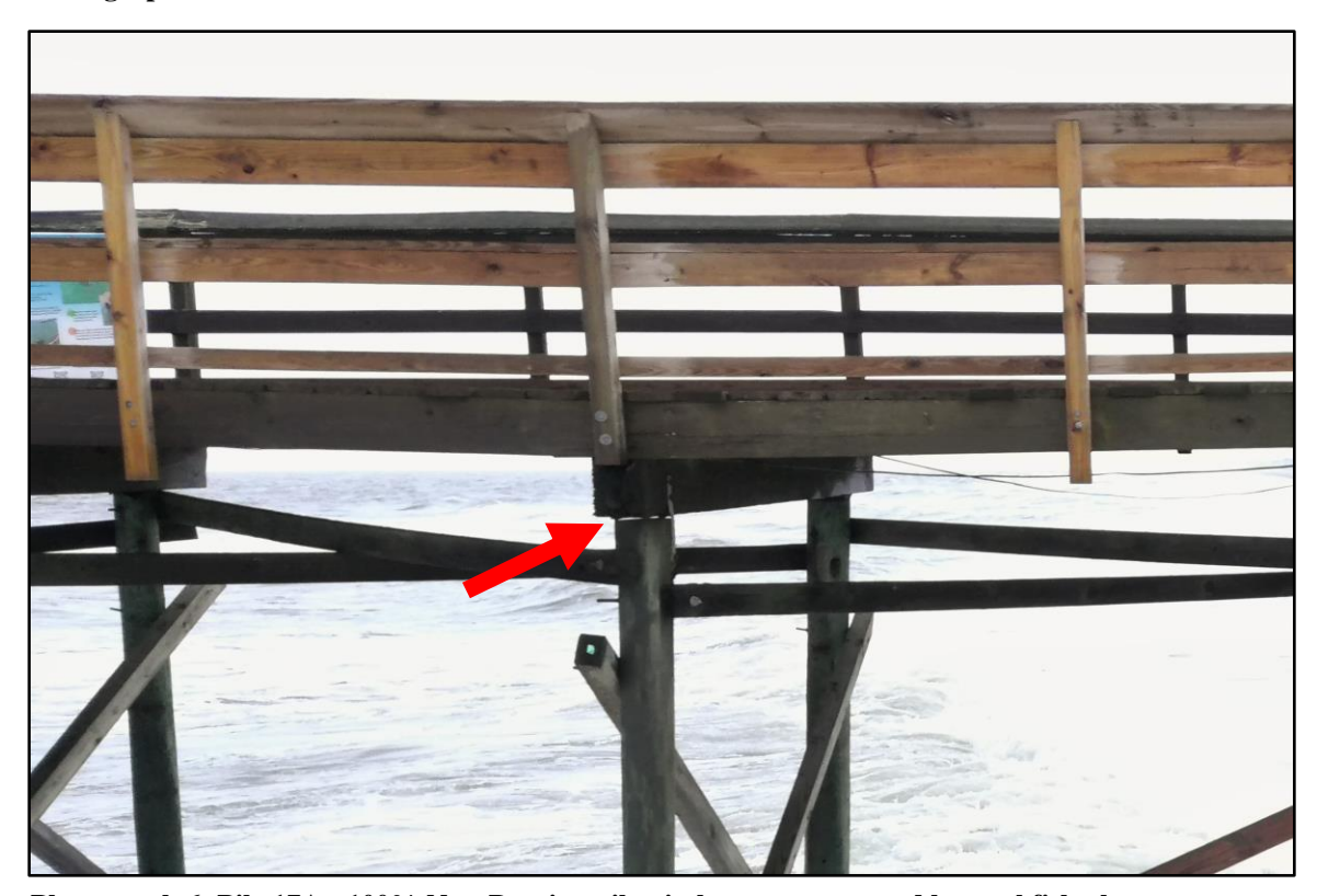
Photograph 6: Pile 17A - 100% Non-Bearing pile, timber cap supported by steel fish plates