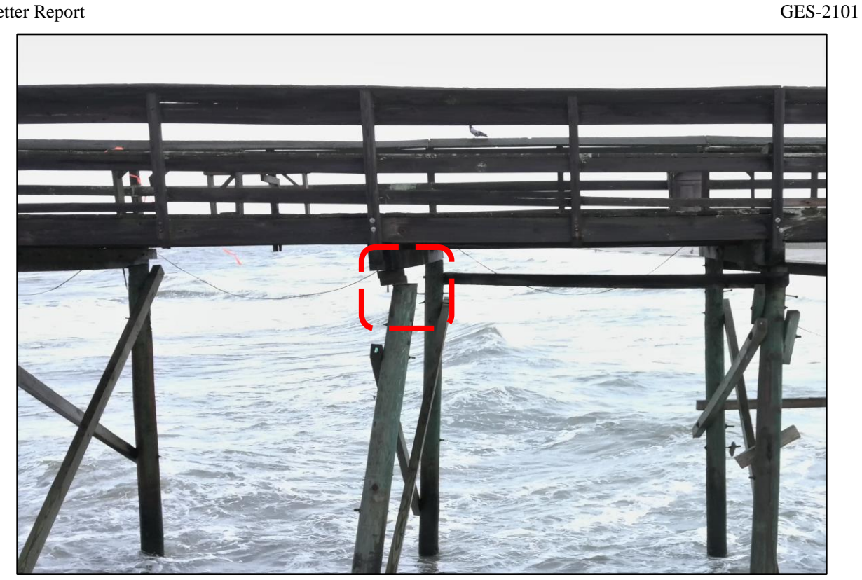
Photograph 7: Pile 24A - 50% Bearing due to displaced pile shims