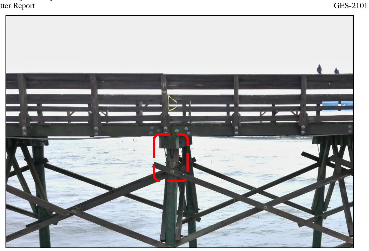
Photograph 9: Pile 40A - Top 18-inch pile is broke/overstressed