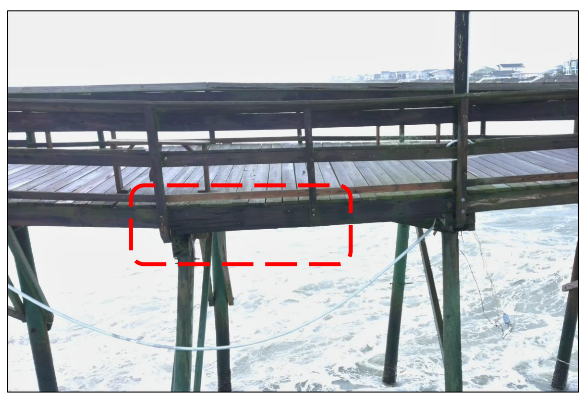
Photograph 14: Bent 27 - Overstressed pile cap & stringer