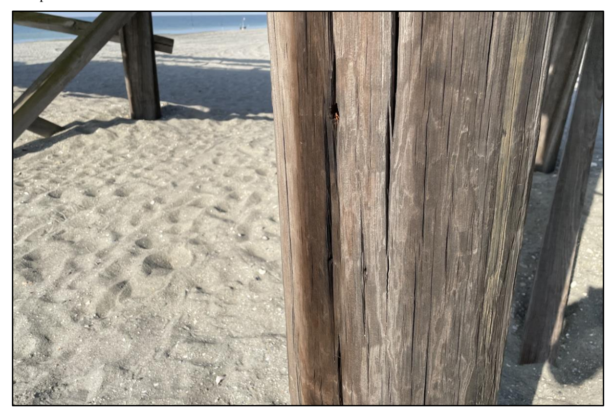
Photograph \ 3: Pile \ 7A-Typical \ checking \ and \ weathering \ found \ on \ original \ vintage \ piles