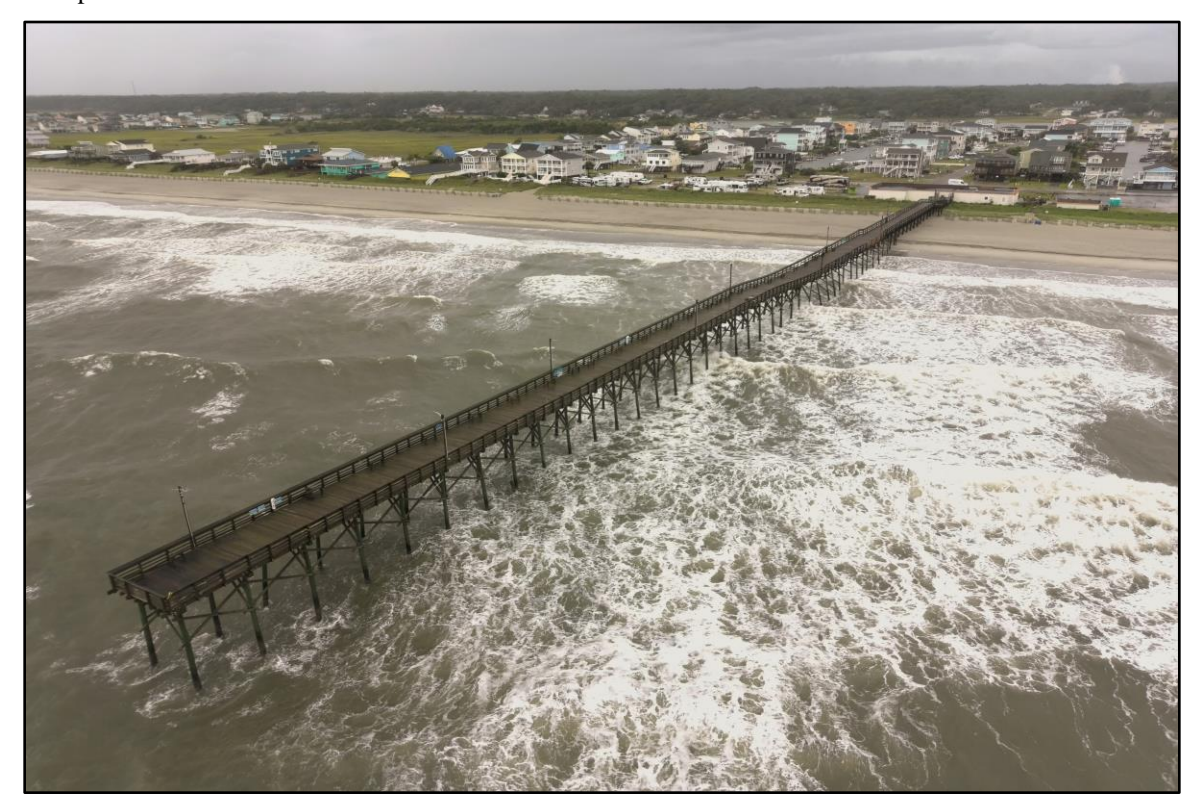
Photograph 1: Overall of Holden Beach Pier