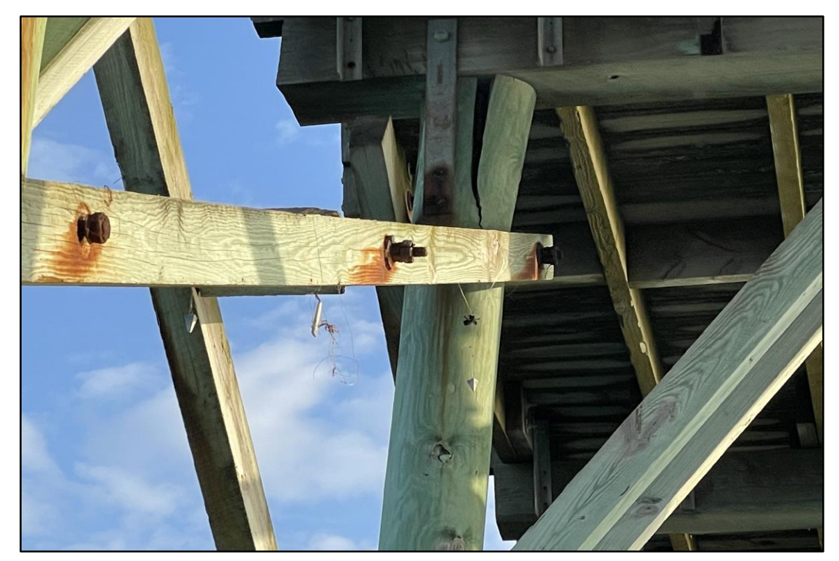
Photograph 12: Pile 50B - Top 18-inch pile is broke/overstressed