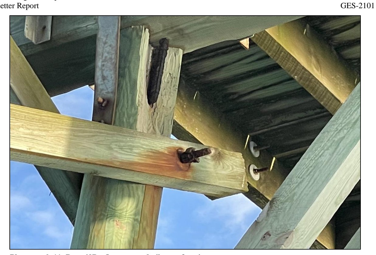
Photograph 11: Bent 49B - Overstressed pile cap & stringer