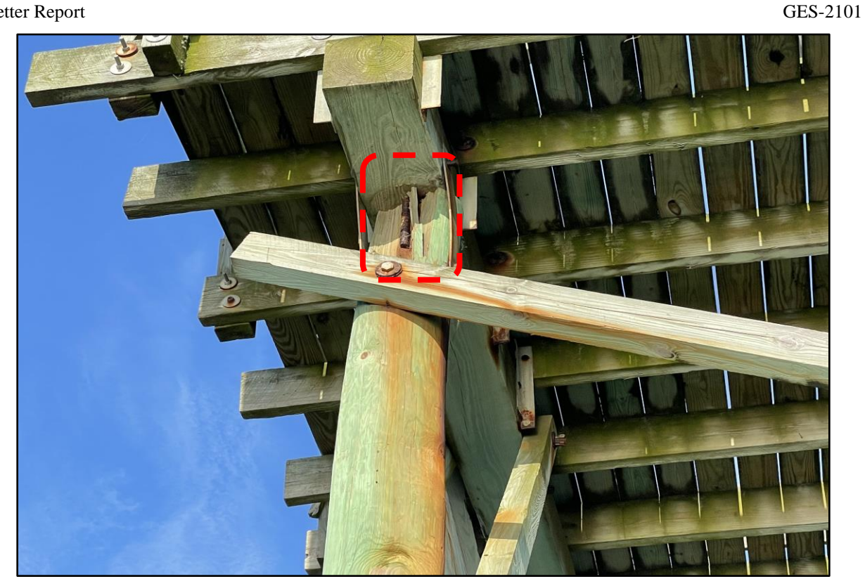
Photograph 13: Pile 52A - Top 18-inch pile is broke/overstressed