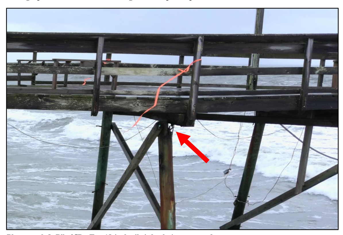
Photograph 8: Pile 25B - Top 18-inch pile is broke/overstressed