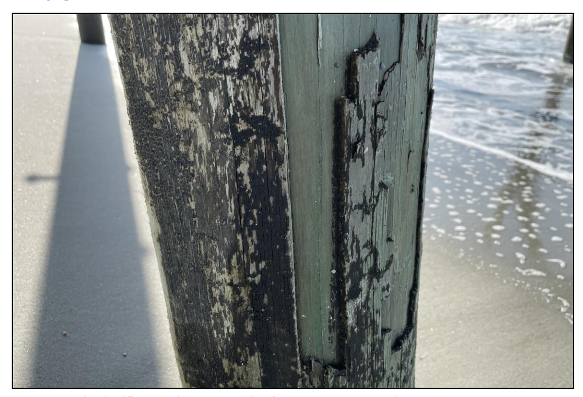
Photograph 2: Pile 25B – Typical shell peeling found on greenheart piles