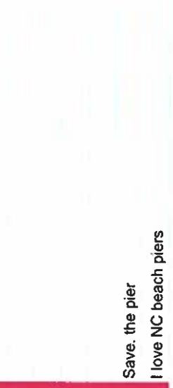
Save. the pier I love NC beach piers

The pier is an important economic anchor for Holden Beach. I've been going to Holden Beach all my life. My grandparents have a house down there. We have always gone to the pier and walked down to the water. The pier is a landmark to us and it's how I know where to get back to my car. It also is a meet spot if we decide to split up on the beach. The pier also provides shade for us to take a break from the scorching sun. We never could get an umbrella to work or it would blow away. We would be so sad if it gets tore down and not built back as soon as possible.