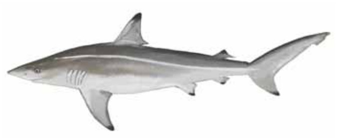
• Spinner (Carcharhinus brevipinna)