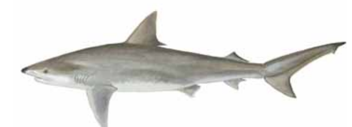
• Blacknose (Carcharchinus acronotus)