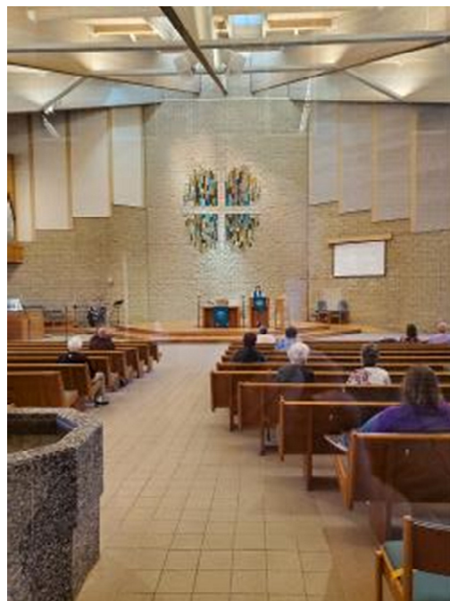
Limited, in-person worship on Sunday, October 18.