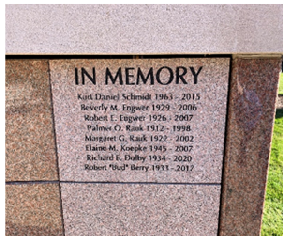
Second Memorial wall added on October 2, 2020.