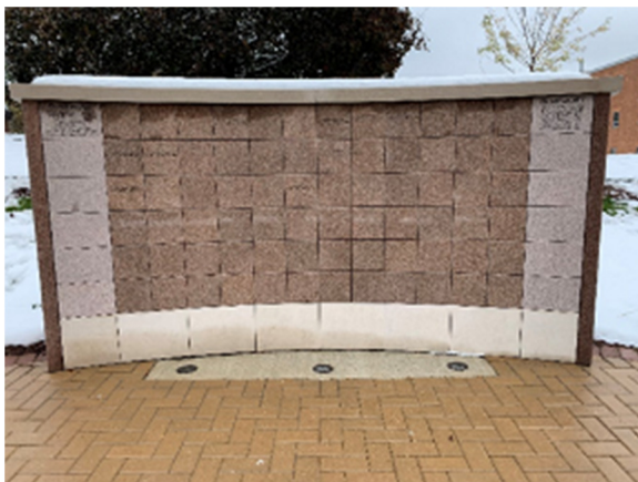
Front view of Columbarium with first Memorial Wall completed August 2019 and dedicated Sept. 8, 2019.