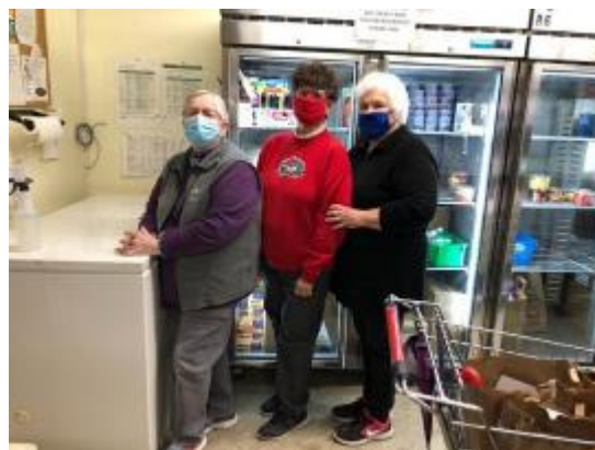
Volunteers at the North St. Paul Area Food Shelf check out the new refrigeration storage