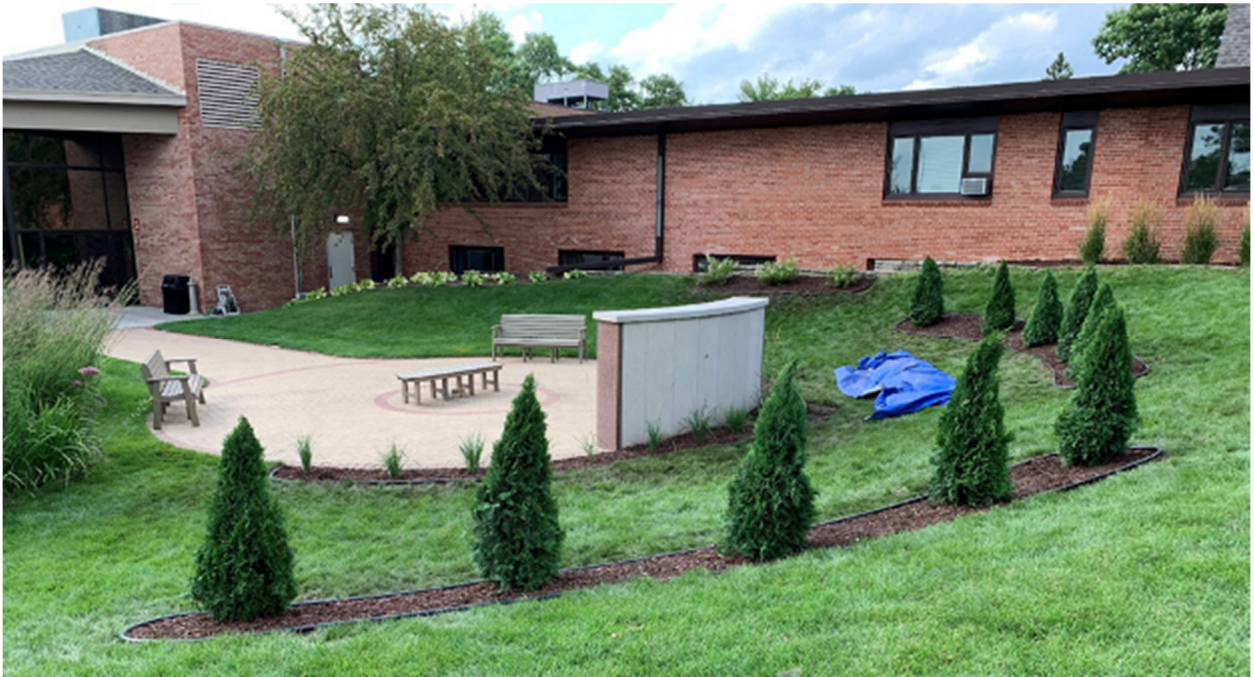
August 2020 improvements to the Memorial Garden Landscaping. Three new benches were added June 2020 and secured in place. Trees and shrubs were added