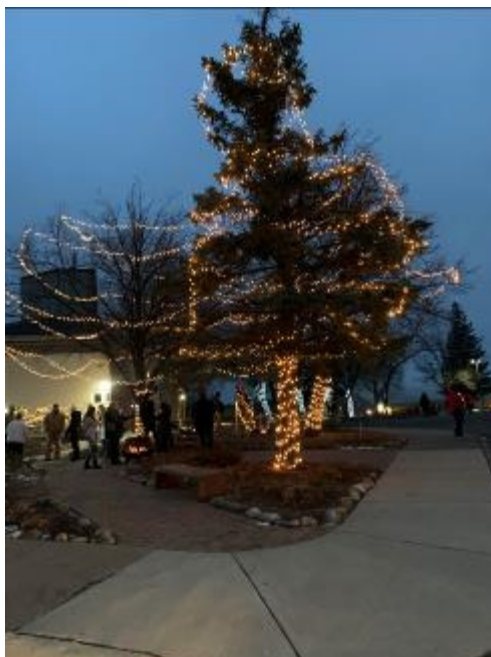
Drive/Walk-thru Christmas experience on Sunday, December 20.