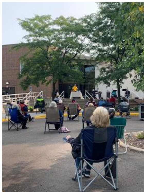
Outdoor parking lot worship service on Sunday, September 13.